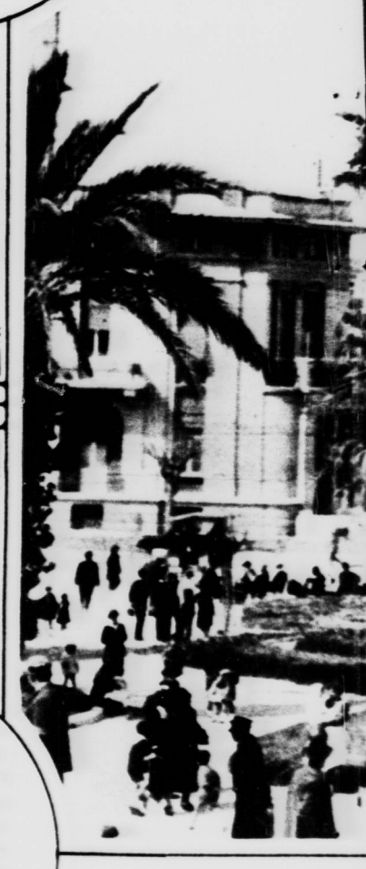
This looks balmy sky and