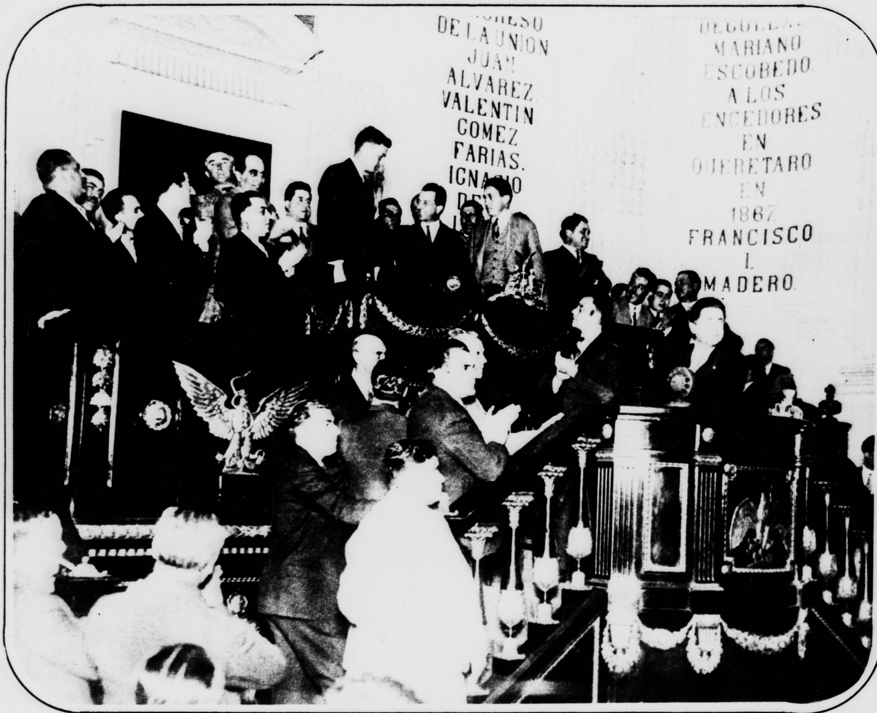
The Mexican Congress honors America's good-will ambassador of the air, Col. Charles Lindbergh on the Senate rostrum as he was presented with a medal by the Congress in appreciation of his flight to Mexico City.