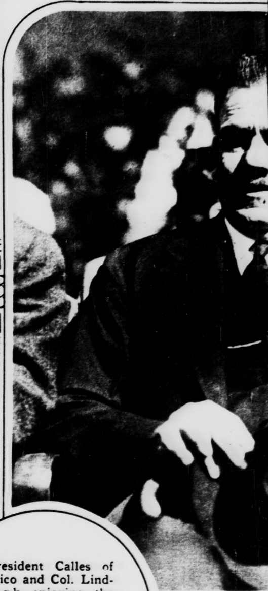
President Calles of Mexico and Col. Lindbergh enjoying the spectacle of the grand fiesta held at the Mexico City stadium in honor of the flyer's visit.