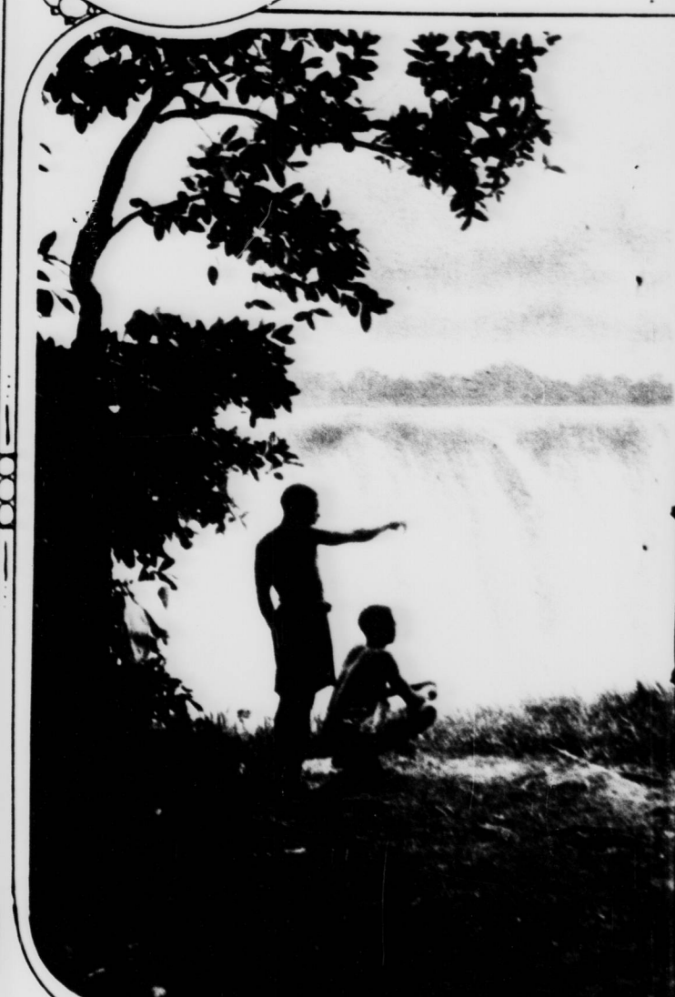
Niagara's rival of the Dark Continent. The might regarded as surpassing Niagara's scenic wonders.