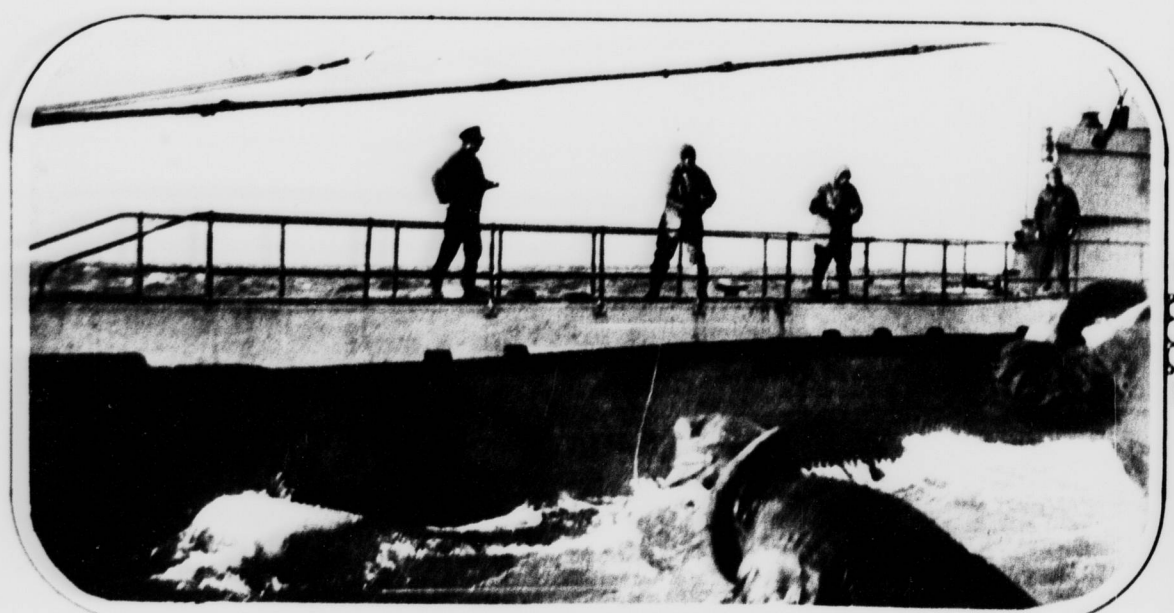
Aboard the submarine S-8, sister ship of the ill-fated S-4, which played an important part in the attempted rescue. Fishermen are sending cigarettes to the crew by a line during the gale which halted rescue work.