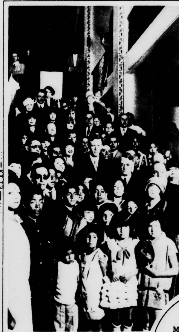
Col. Lindbergh and Ambassador Morrow with group at the Juarez School, after the flyer had dedicated the Lincoln Memorial Library there.