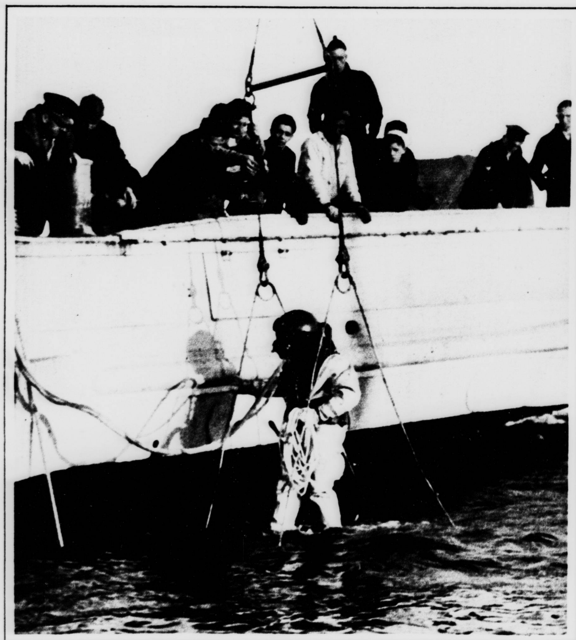
While hope still survived for the rescue of the entrapped men in the sunken submarine S-4. A Navy diver descending from the minesweeper Falcon to the ill-fated submersible.