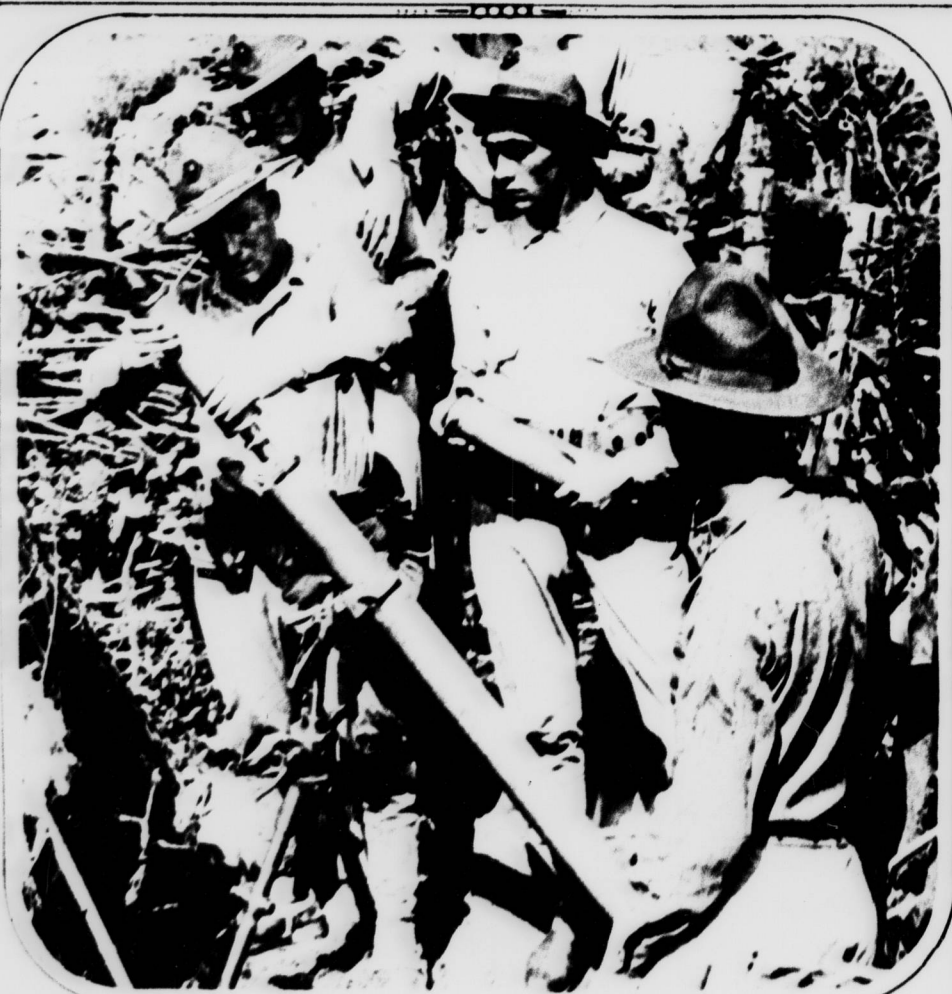
Recalling World War scenes on the western front. United States Marines operating a trench mortar in an intrenchment near Ocotal, Nicaragua.