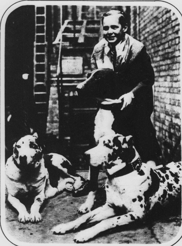
Jackie Coogan, a big boy now of 14, makes friends with a trio of Great Danes between his vaudeville turns at the Palladium in London.