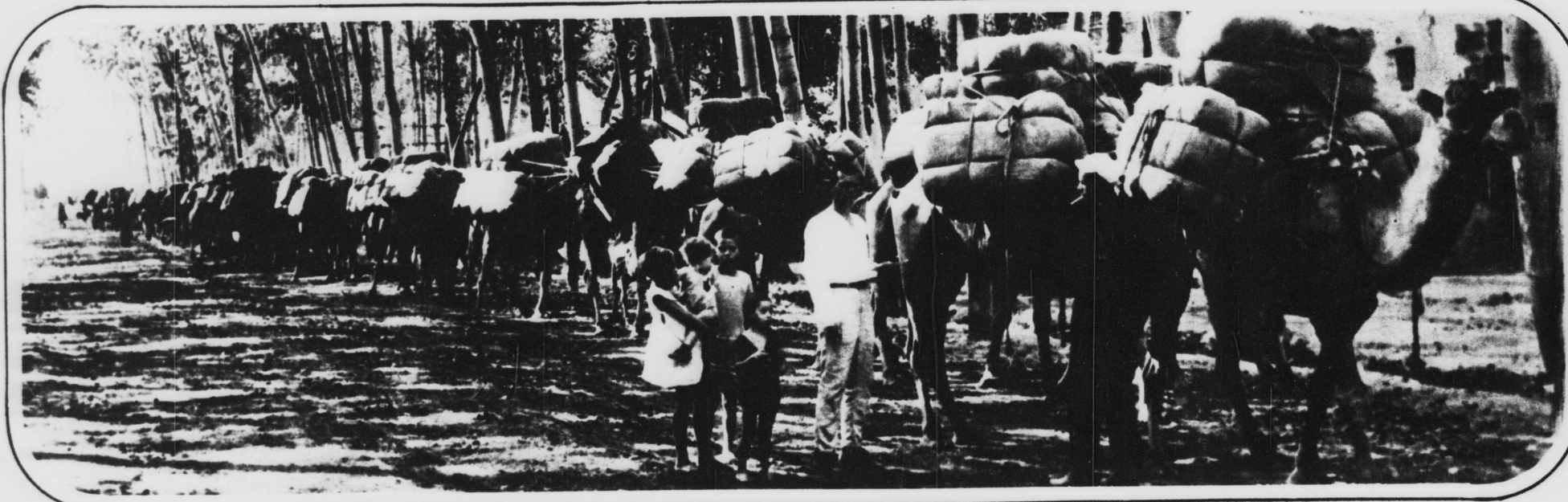
The camels are coming with supplies for Soviet Russia. One of the many caravans seen along the road from Turkestan to Central Russia.