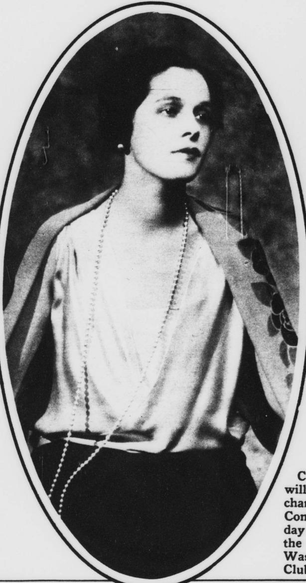
Cornelia Otis Skinner, who will appear in a program of character sketches at Memorial Continental Hall next Saturday evening for the benefit of the scholarship fund of the Washington Smith College Club.