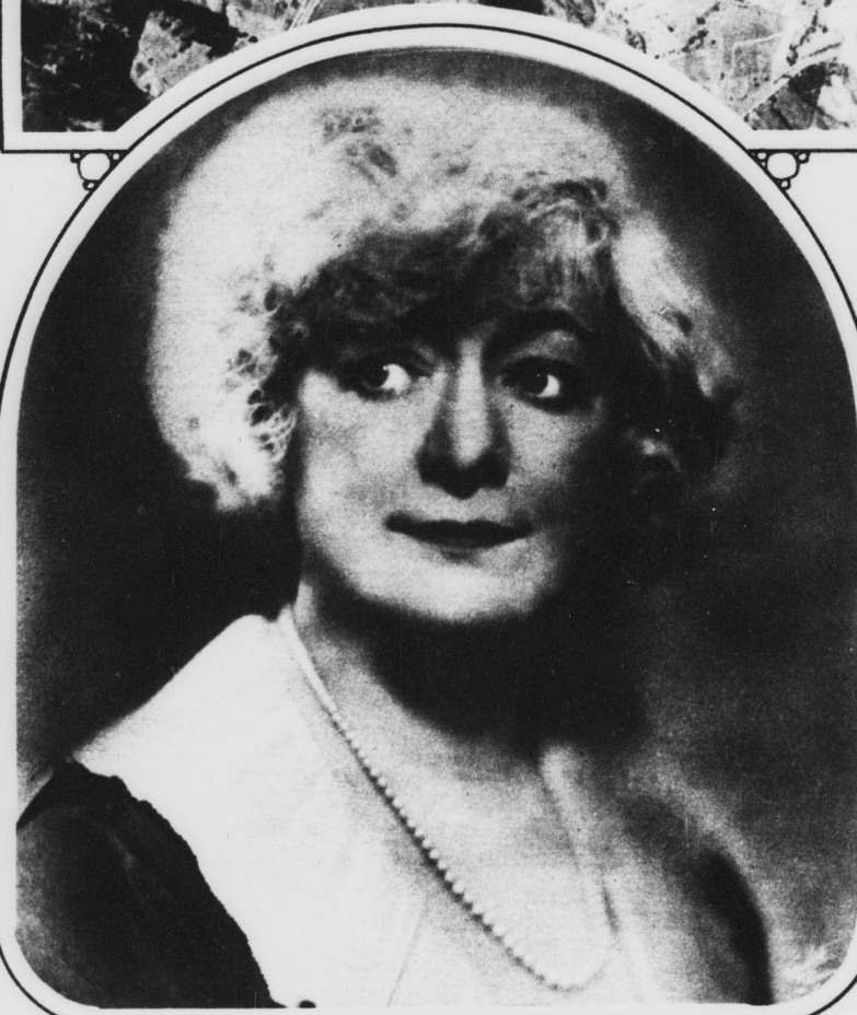
Cecilia Loftus, who plays here this week in George C. Tyler's revival of "Jim the Penman."