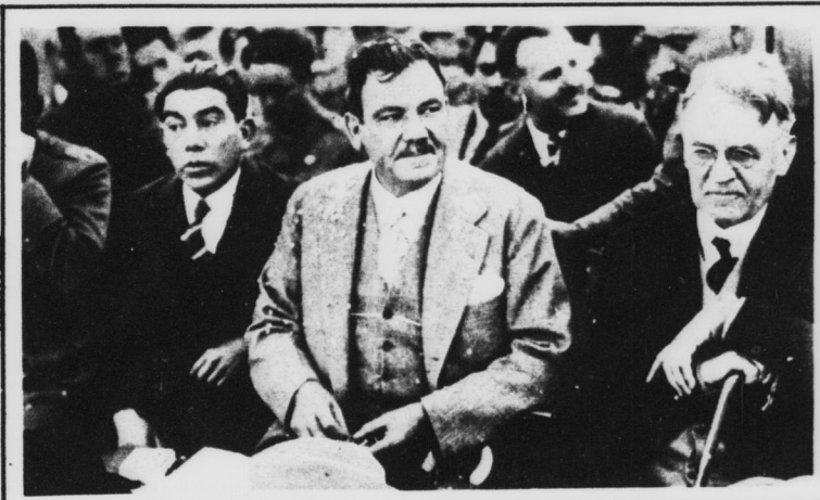
Former President Calles of Mexico showered with confetti as he attends the opening of a government school at Teneria with Ambassador Morrow, his last official act as President.