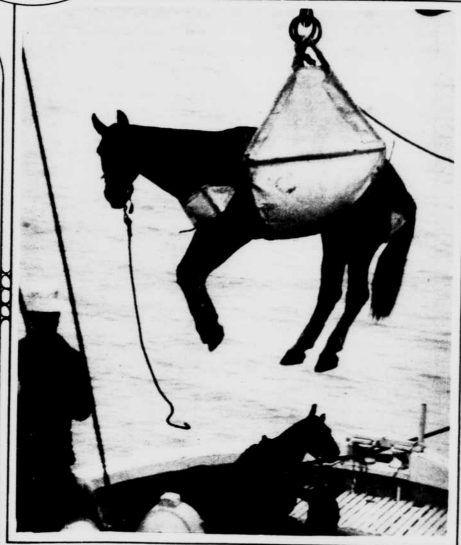
"War" is tough on horses. When the attacking force landed on the Hawaiian Islands in the combined Army and Navy maneuvers, horses were sent ashore too. This is how they were transferred from a transport to a lighter.