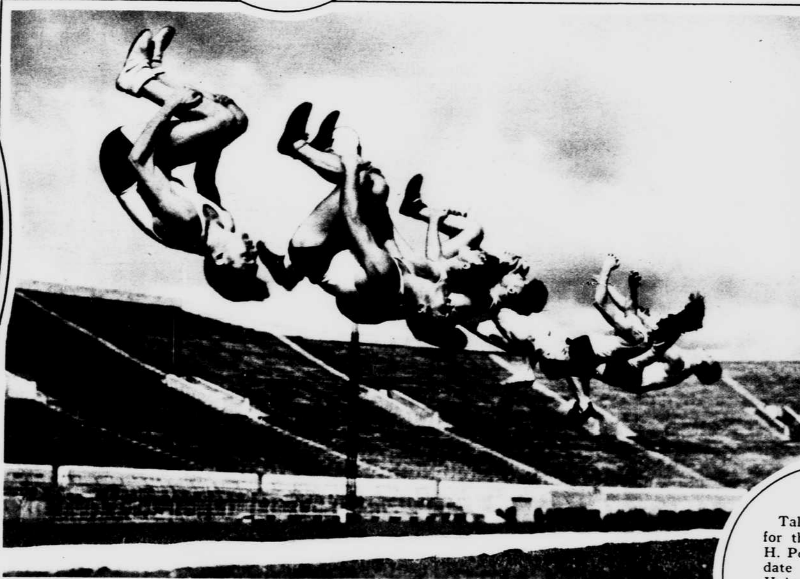
Full of the joy of living. So seem these crack tumblers as they tune up in their tumbling for the American Olympic tryouts in the Rose Bowl at Pasadena, Calif.