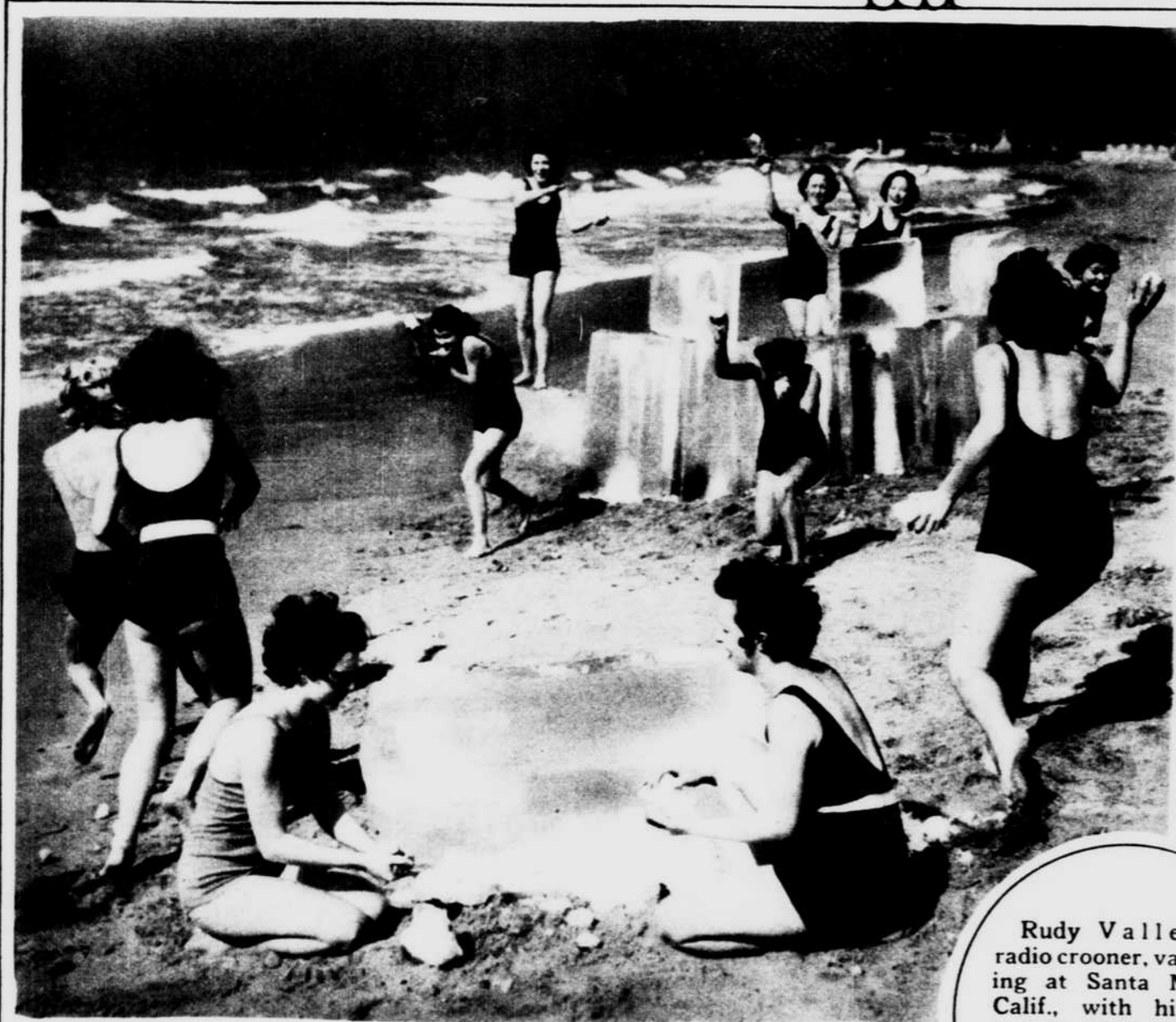
A good time was had by all. This fracas on the beach at Santa Monica, Calif., seems to be a snowball battle, with ice supplying the homemade variety of snow.