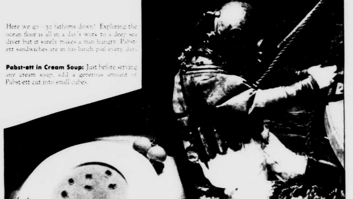
Here we go—30 fathoms down! Exploring the ocean floor is all in a day's work to a deep sea diver but it surely makes a man hungry. Pabst-ett sandwiches are in his lunch pail every day.