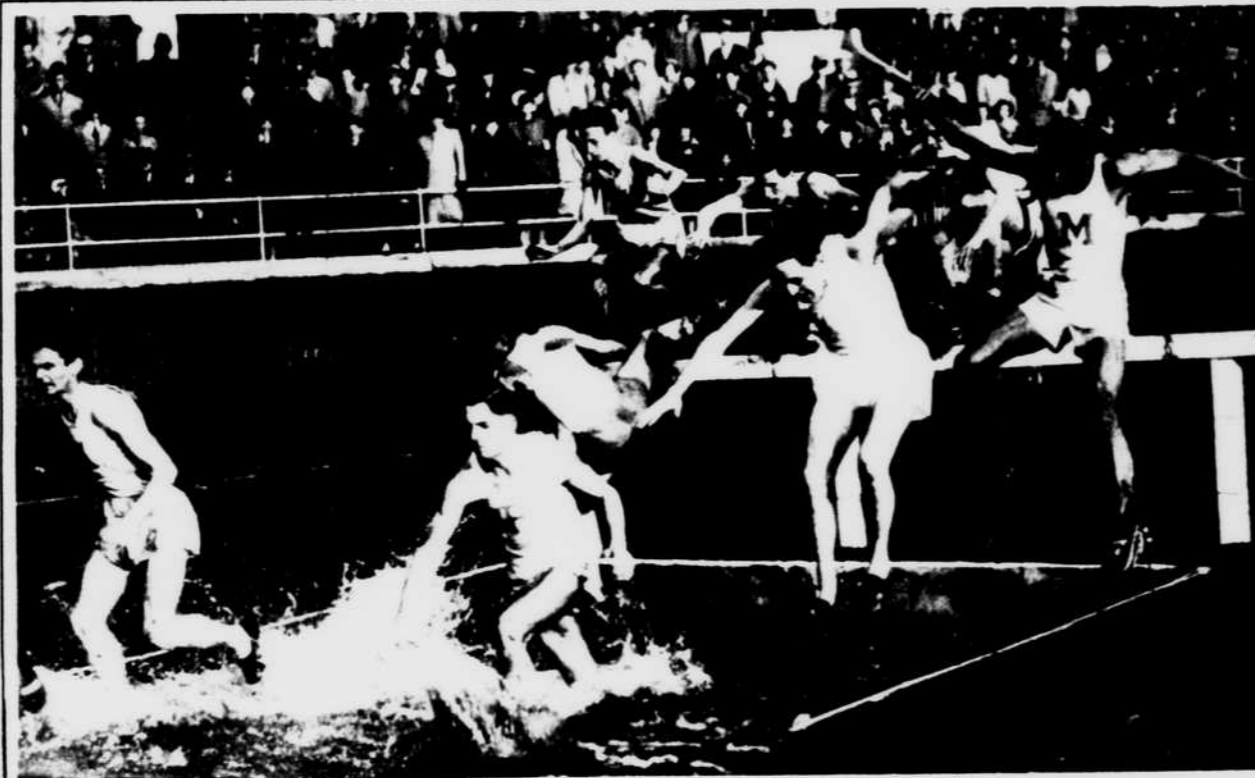
Splashing through in the steeplechase. Contestants in this grueling event of the Penn Relay Carnival had rain and mud as well as the water jumps to contend with.