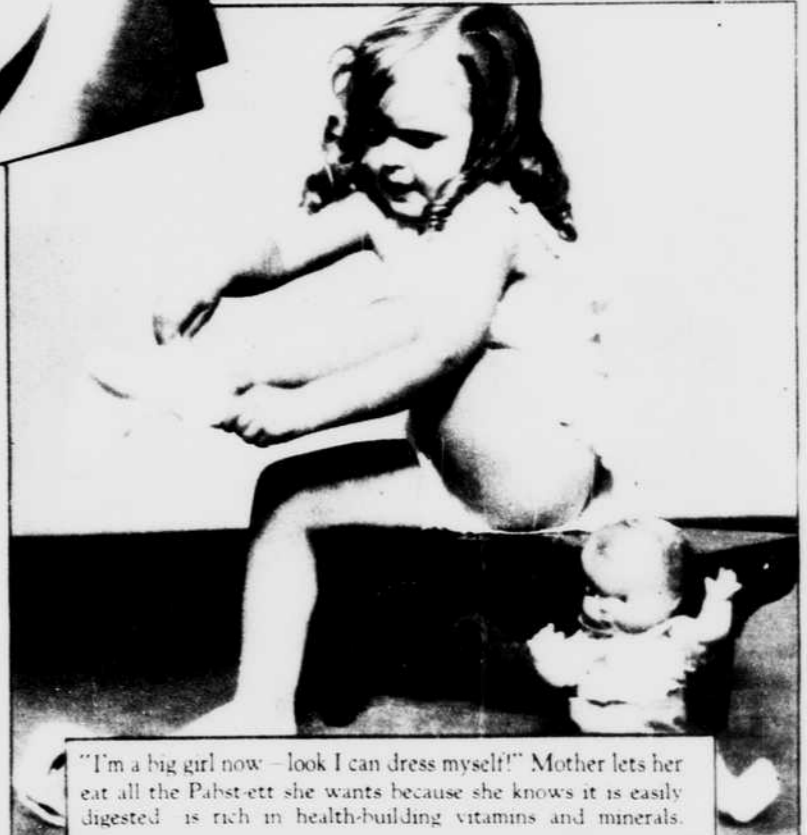
"I'm a big girl now—look I can dress myself!" Mother lets her eat all the Pabst-ett she wants because she knows it is easily digested—is rich in health-building vitamins and minerals.