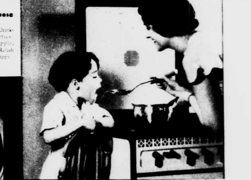
"Gee, that's good!" Children love the rich flavor Pabst-ett gives to soups and sauces. Pabst-ett melts quickly, never gets stringy. Two Varieties: Standard, Pimento