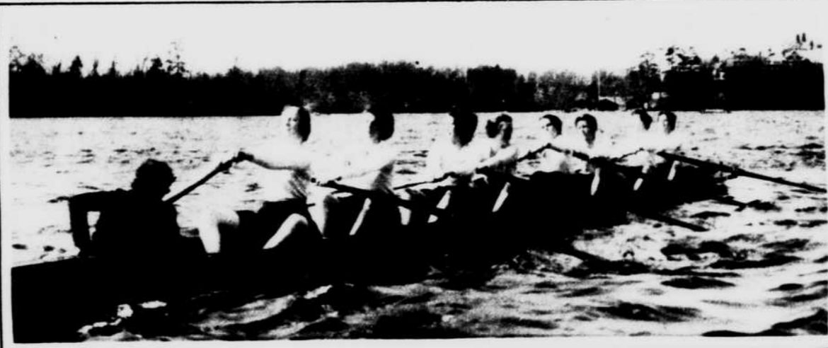
For dear old Wellesley! Girls of the freshman eight-oared crew churning up the lake waters in an early season workout at Wellesley, Mass.