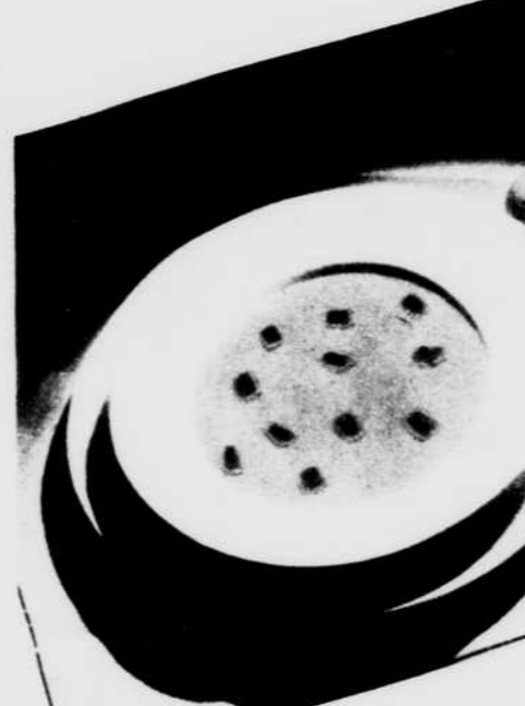
Pabst-ett in Cream Soup: Just before serving any cream soup, add a generous amount of Pabst-ett cut into small cubes.