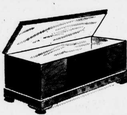
44-in. Cedar Chest

Genuine "Lane" with walnut veneer exterior. 44-inch size. Cedar-lined interior.