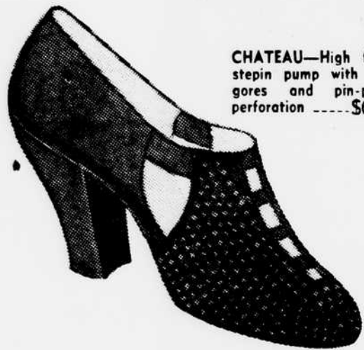
CHATEAU—High front step pump with side gores and pin-point perforation. $6.50