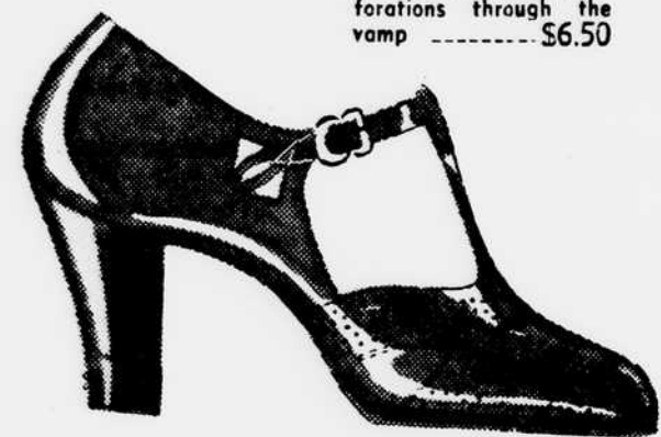
PETITE—Dressy T-strap in navy calf with perforations through the vamp. $6.50