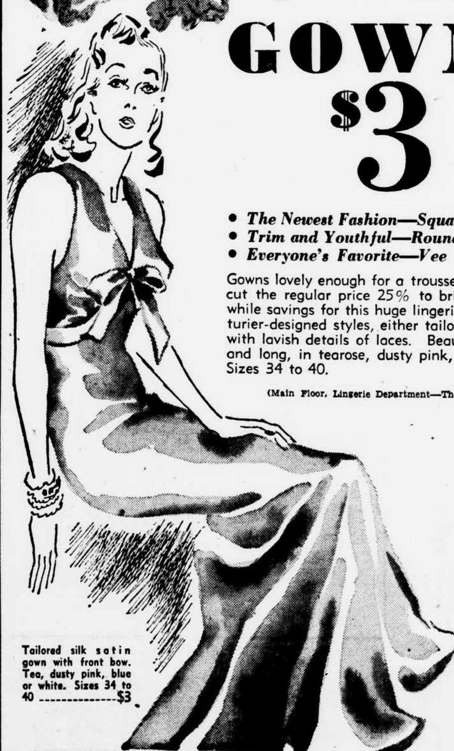
Tailored silk satin gown with front bow. Tea, dusty pink, blue or white. Sizes 34 to 40. $3

(Main Floor, Lingerie Department—The Hecht Co.)