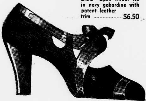
LIDO—Open throat tie in navy gabardine with patent leather trim. $6.50