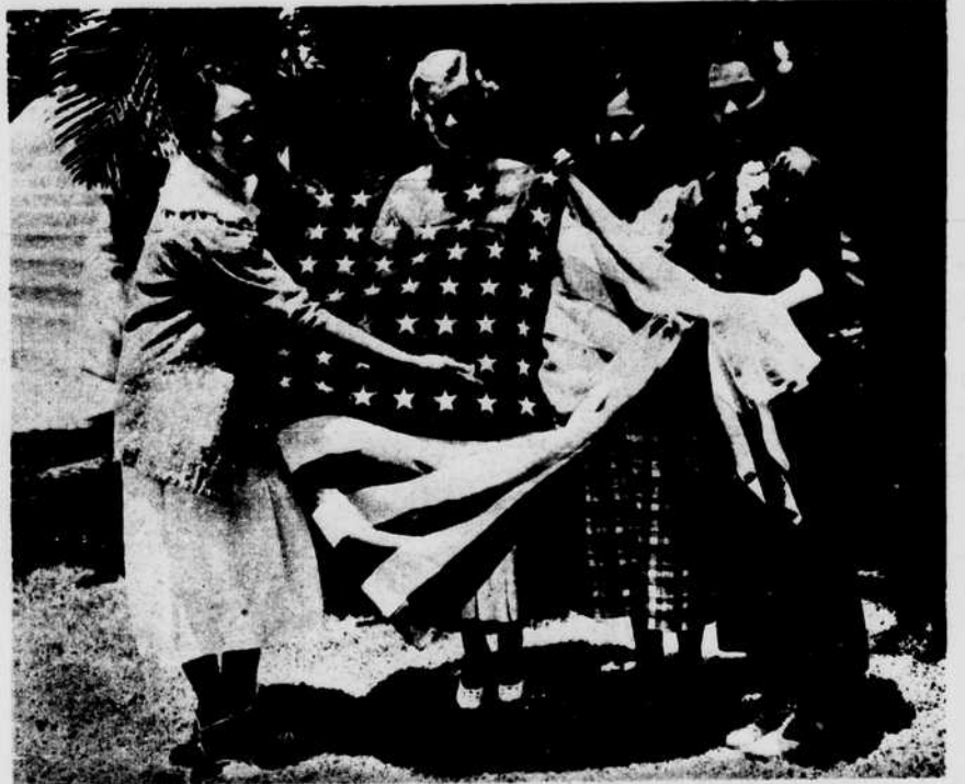
Flag Day in the "Forty-ninth State." Hawaii wants to become an added star in that field of blue and Flag Day is much observed in the islands by maidens dark and fair.

"The Paths of Happiness and Sentiment Lead to Shah & Shah"