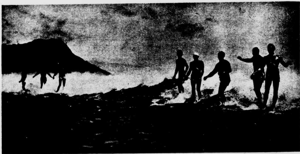
Surf-riding on the combers at Waikiki Beach is a sport that thrills.