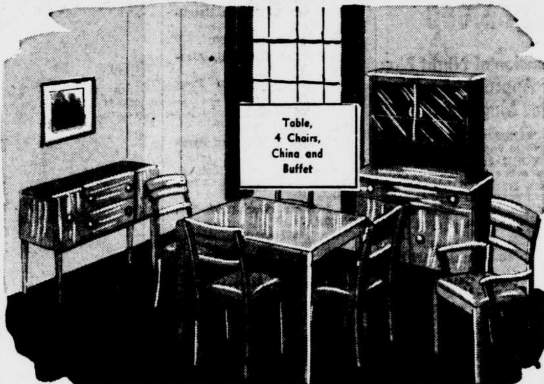
Table, 4 Chairs, China and Buffet

• All Sears Stores Open Thursday, Friday and Saturday Nights to 9:30!