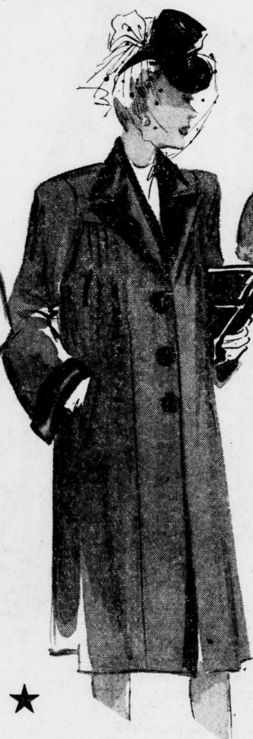
★ Velvet Collared Box Coat $59.75

WOMEN—smart, simple lines; one of the most becoming new coats to be found. The rayon velvet revers and cuffs give it a young distinction, the soft shirring in the yoke is most flattering to a woman's figure. Fine, black, soft and warm 100% wool, and warmly interlined with 100% reused wool.