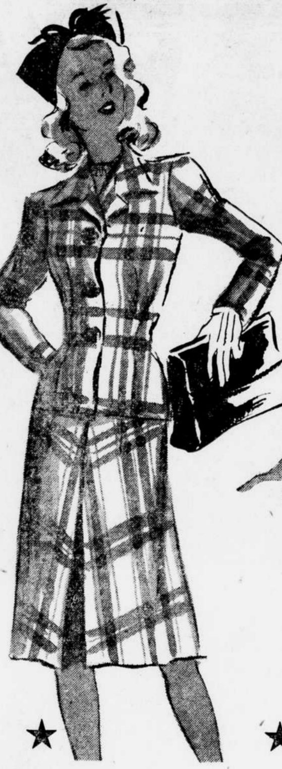
★ Young, Bold Plaided Wool $22.95

JUNIORS—this bright two piece stars for its warmth—(45% wool, 5% rabbit hair, 50% rayon) and its versatility—wear it as a suit with your blouses. Smart wooden buttoned jacket and easy walking kick pleat in the skirt. Brown-beige plaid, 9 to 15.