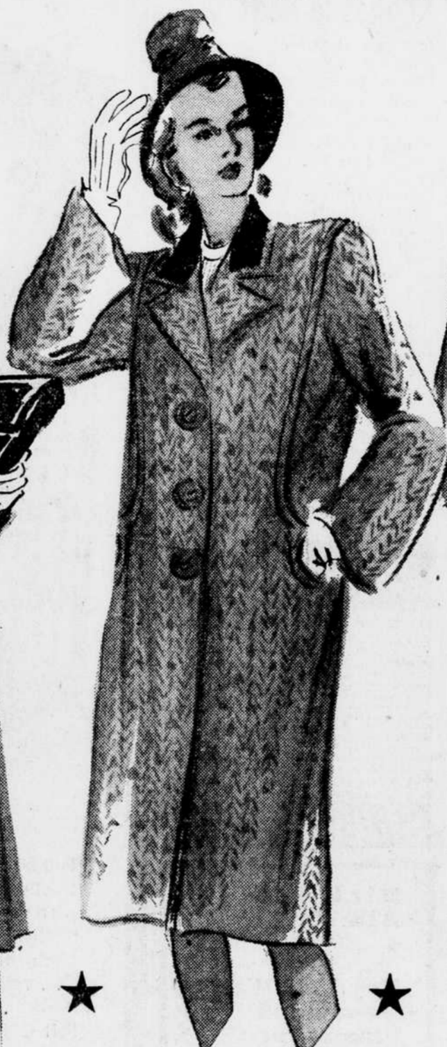
★ Wool Tweed Chesterfield $39.75

MISSSES—the coat of coats for your casual wardrobe—styled in a long lived, 100% warm, smart speckled wool with grandly built shoulders, interestingly new scoopy pockets and lined in 100% reused wool for additional warmth. An investment if there ever was one. Brown, black, green, blue. Misses' sizes.