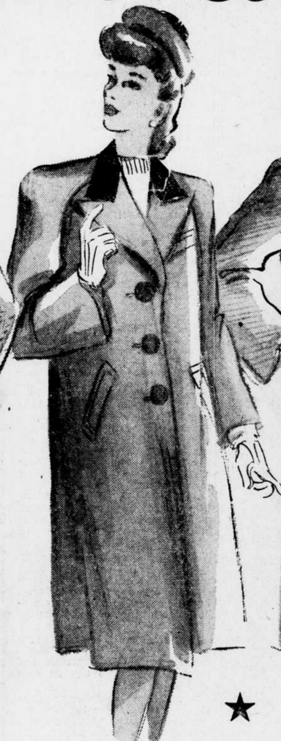
★ Champion Chesterfield $39.75

MISSSES—this splendid coat is a bigger favorite than ever this winter. Luxuriously warm and the essence of simplicity. So roomy it can go over everything, so practical it can go anywhere. Raglan shoulder, slant pockets and warm 100% wool with 100% reused wool lining are some of its many features. Red, blue, brown, black.