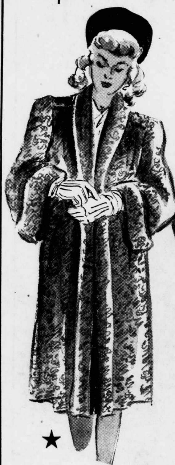
★ India Lamb Fur Coats $288

Queen of the color furs and fashion's newest belle. A beautiful pearly grey, slightly curled flat fur that's warm, light and one of the sturdiest of the grey furs. Styled with becoming long revers, turn-back cuffs and a most flattering yoke back. Also in soft brown. Sizes for misses and juniors.