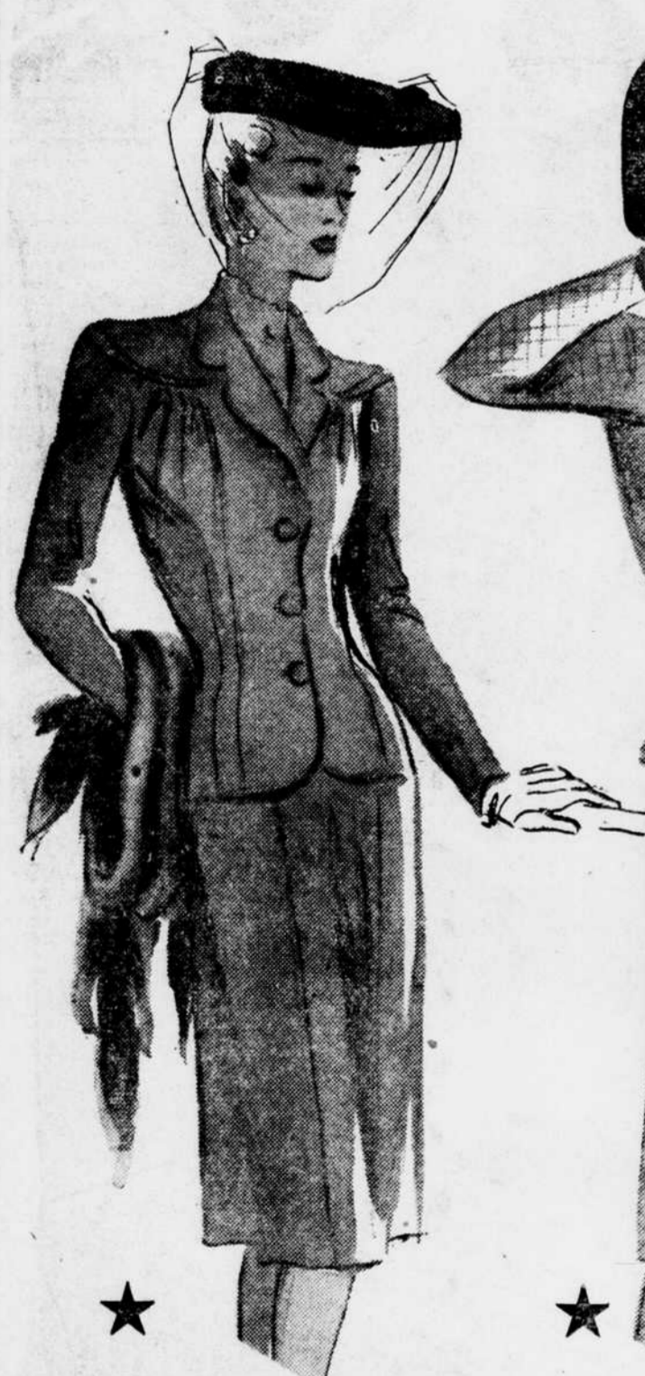
★ Suit-dress Star for Women $25

WOMEN—Stars first for its beautiful colors—laurel green or flying blue then, for its flattering shirred yoke jacket with covered buttons and straight, smart skirt.