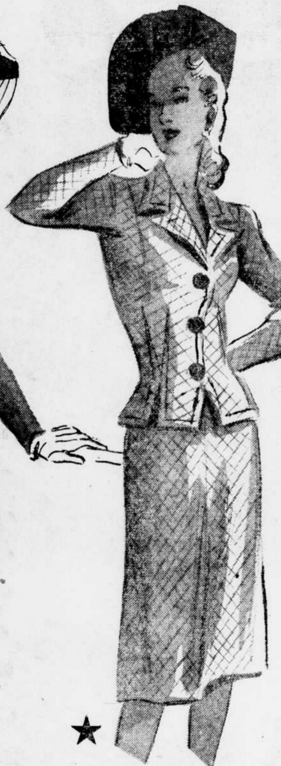
★ Misses Applaud the Wool Suit-dress $19.95

MISSSES—Unusual diamond-pattern smooth 100% wool fabric and the neat hugging lines of the cutaway jacket, the slight front flare in the skirt. Beige or grey.