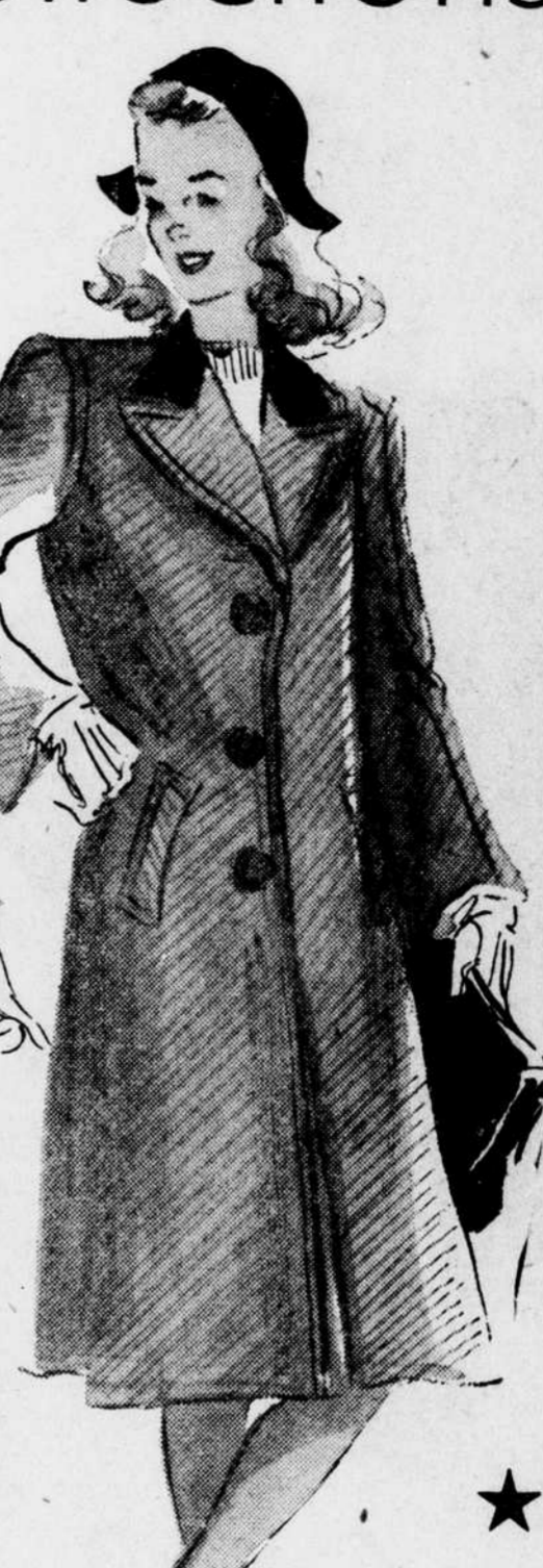
★ Stroock's Chesterfield $44

JUNIORS—one of the finest virgin wools, Stroock's "Mollendo," makes your topcoat a topnotcher. Distinctively cut with flattering welt detailed revers, black rayon velvet, "Chesterfield" collar and good-looking slant pockets. Wear it over everything you own, warmly and smartly. Raspberry, blue; 9 to 15.