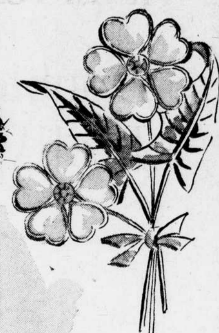
★ Jewel-bright Flower Pins $1.95 & $3

Pin one of these sentimental daisies on your fall lapel for a touch of gaiety and brightness. Gilt metals set with simulated stones—rubies, sapphires, topaz, amethysts. Bow tied Daisy, $1.95. Daisy Spray, $3.