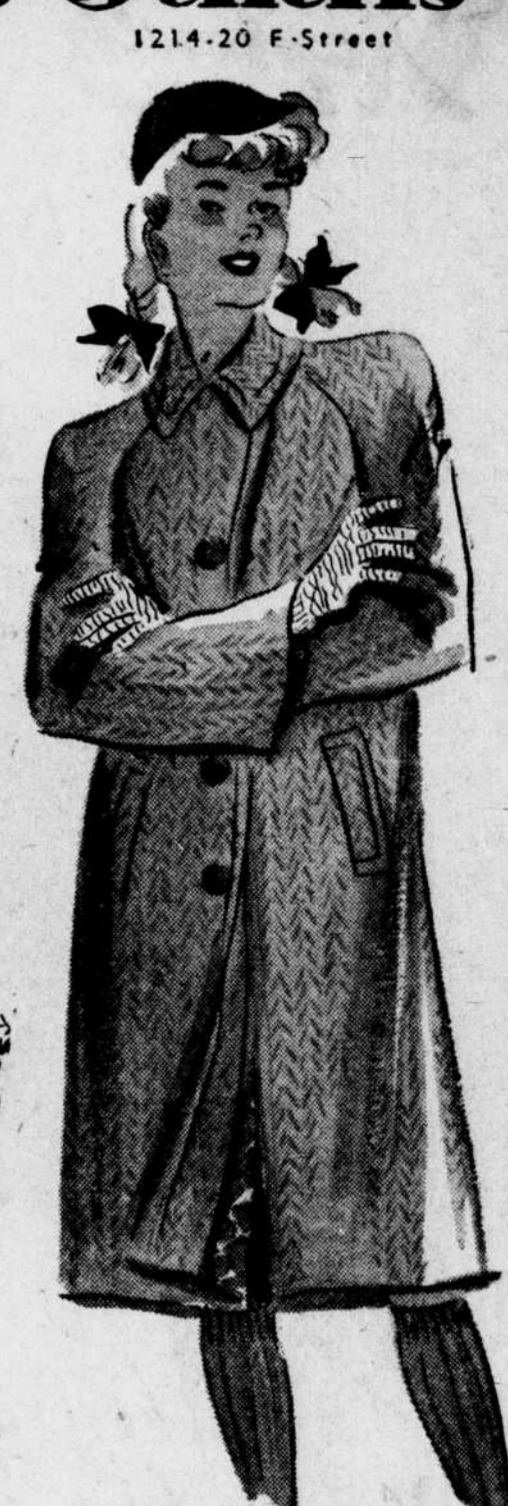
★ Quilt-lined Tweed Topcoat $25

TEENAGERS—go to the head of fashion's class with this good-looking topcoat. Fabric is 100% heather mixture cut to taste and is cuddly-warm. The quilt lining is a further protection against the cold. Heather blue. 10 to 16.