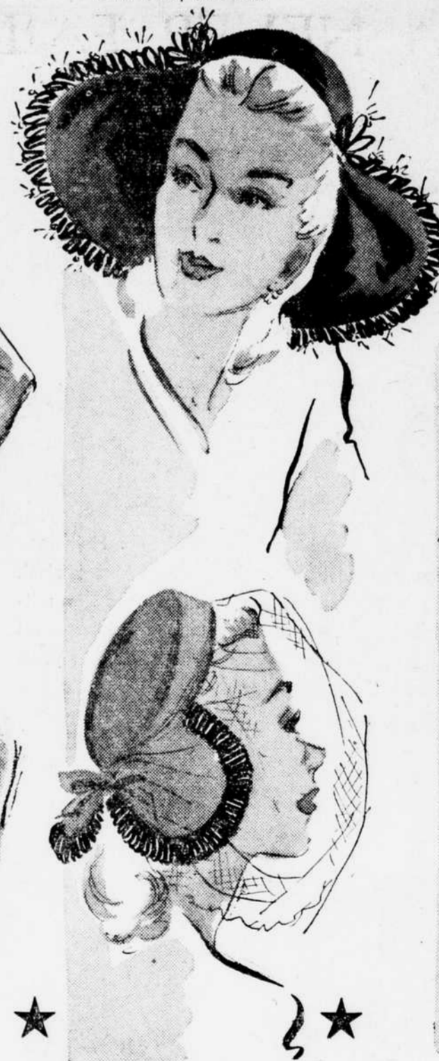
★ Angelic Bare-Brow Hats

They're so wonderfully becoming, so young making, and they fit down on your head so snug you'll love them.