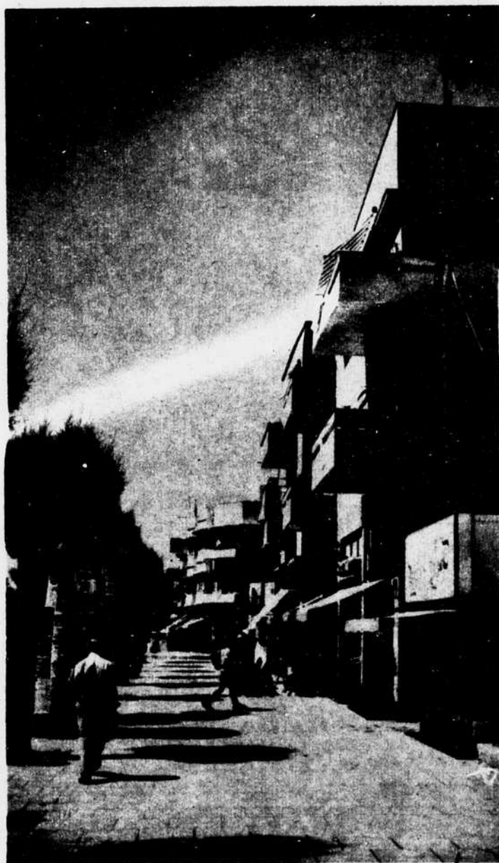
Modern apartment buildings and stores in Tel Aviv are a decided contrast to the old sections of Palestine's towns.