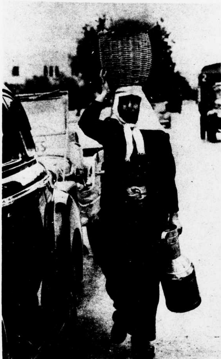
An Arab woman, walking by a modern car and jeep, uses an ancient method of carrying a basket.