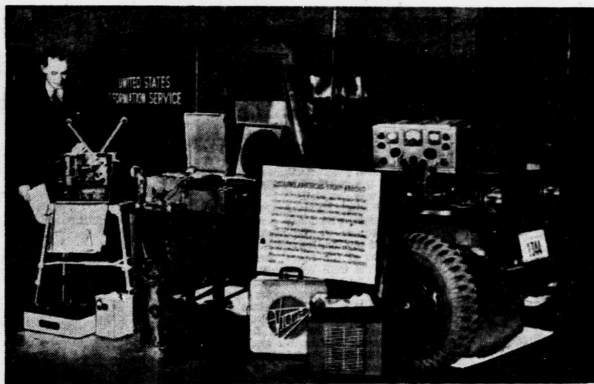
JEOP TO CARRY AMERICA'S STORY TO WORLD —George V. Allen, Assistant Secretary of State in charge of the international information program, looks over the specially-equipped jeep which will carry the "Voice of America" to places in foreign lands that are off the beaten track.