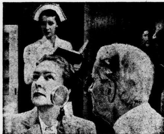
A FAMOUS DOCTOR, whose lifetime study has been skin care, recently developed a new "Home Facial" that's really wonderful—actually helped 4 out of 5 women to lovelier-looking skin in clinical tests. (For ethical reasons, actual doctor not used in this picture.)

Evening—3. At night again "creamwash" your face with Noxzema and gently dry. 4. Now, massage Noxzema delicately into your face. Pat a little extra on over any blemishes. It helps heal them. And no messy pillow smears with Noxzema. It's greaseless. Follow these 4 simple steps