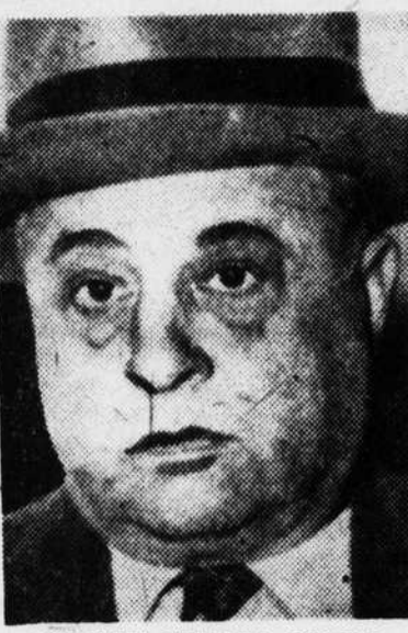
GREASY THUMB GUZIK. Wouldn't even tell his age.