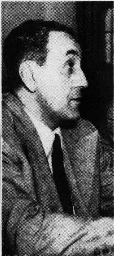
SILENT WITNESS—Anthony J. (Tony) Accardo, reputed Chicago gambling boss, at witness table during Senate investigation.

Accardo, back when he was a strong-arm man in Chicago's underworld and reputedly a body-