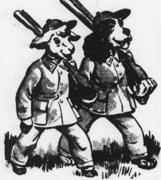
The lamb and the dog are again frisking about in the Howser yard.