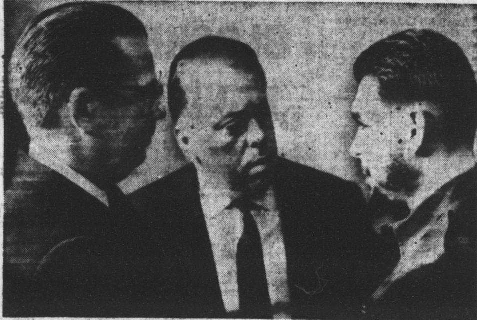
Cuba's economic boss, Maj. Ernesto Guevara (right), chats with Sergei Kudryvatsov (center), Soviet Ambassador to Cuba, and Cuban President Osvaldo Dorticos before leaving Havana on an economic mission to Moscow and five other Communist nations including Red China.

counter the disguised aircraft, claim in advance by rejecting "energetically and indignantly" everything said in the American note as "absolutely and totally false." He added that the United States Embassy apparently hoped the note would be overlooked and go unanswered—thus avoiding the Cuban advance denial—because Mr. Bonsal had sent it "mixed in with other documents."