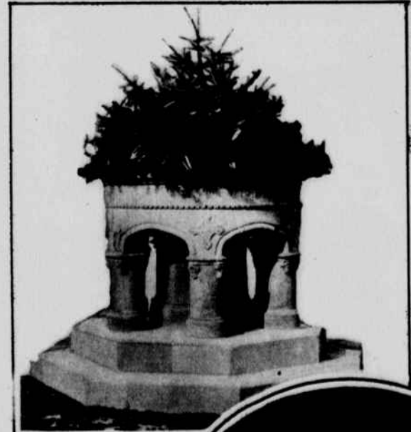
Above—The only memorial to the war dead erected by any cemetery—the stone font recently dedicated by Woodlawn Cemetery, New York.