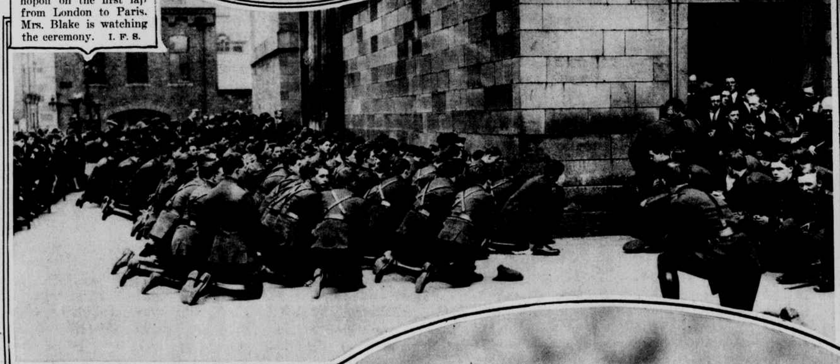
A military requiem, first of its kind in Ireland, celebrated in Dublin for members of the I. R. A. killed during the attack on the Custom House, May 25, 1921. Free State soldiers are praying outside the Pro-Cathedral, which was too crowded to admit them.