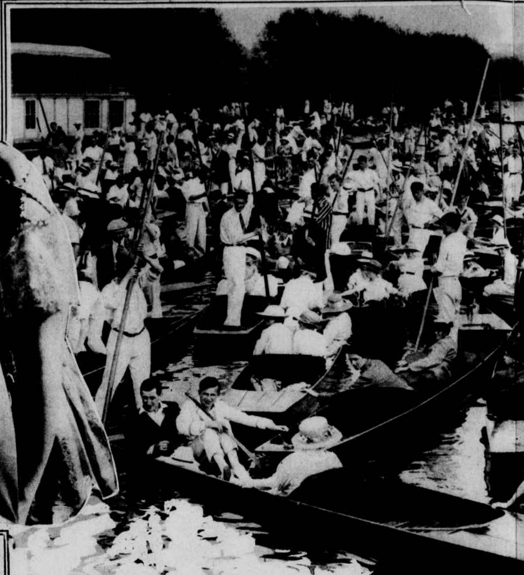
A May day on the Thames—pleasure day of the Oxford "Eights." During regatta on the historic river.