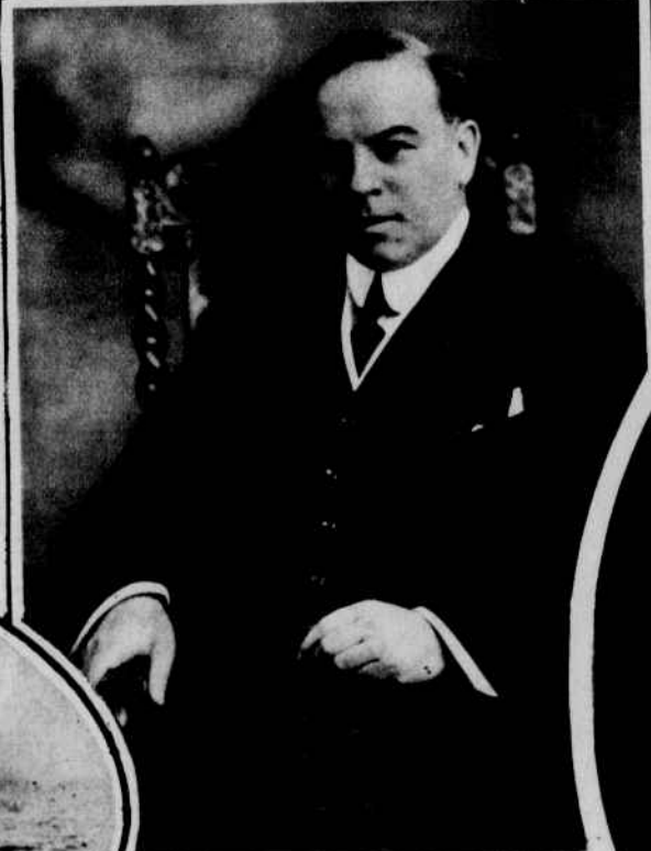
His first photograph in six years—Hon. W. L. Mackenzie King, Premier of Canada.