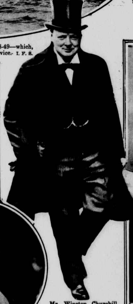
Mr. Winston Churchill leaving the meeting of the Irish Free State delegates in Downing street, London.