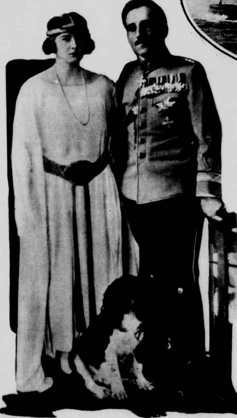
A Royal June Couple—King Alexander of Jugo-Slavia and his June bride, Princess Marie of Rumania.