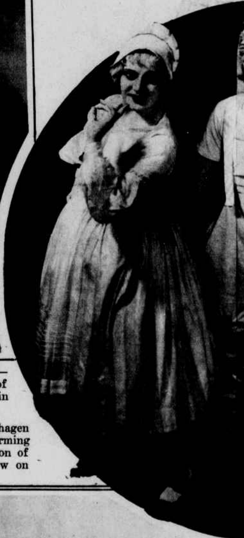
At right—A bit of "Copenhagen Porcelaine"—one of the charming new figures in the second edition of Balieff's "Chauve Souris," now on Century Roof.