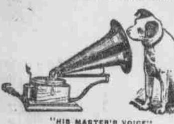
"HIS MASTER'S VOICE"

Is the best place to get up-to-date JANUARY RECORDS for both the