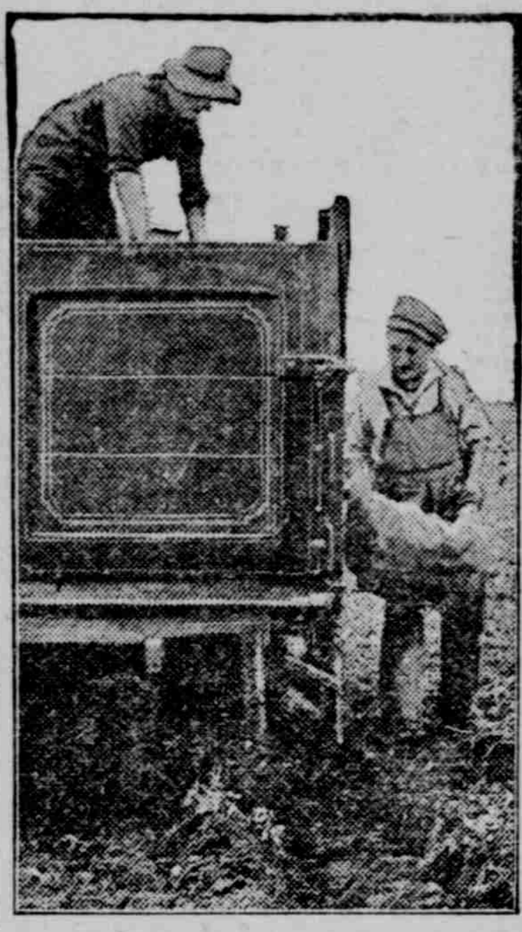
Truck Gathering Potatoes in Field.

So it is with the motor truck. The truck salesman lays special stress on