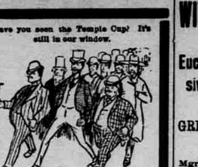
Have you seen the Temple Cup? It's still in our window.

Weather Conditions and General Forecast. The barometer has risen slowly in New England, on the middle Atlantic coast, near Lake Superior, and on the north Pacific coast; it has fallen in all other districts, except in southern Florida, where the conditions continue threatening with brisk to high northerly winds.