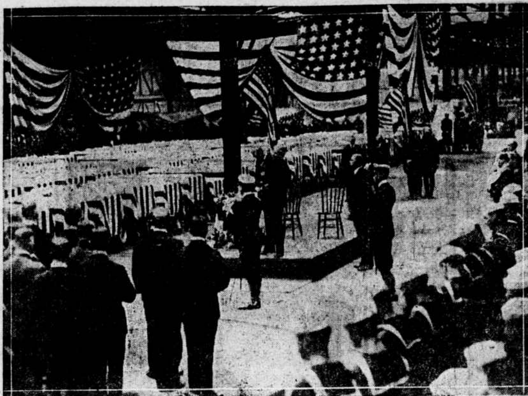
TRIBUTE TO NAVY'S HERO DEAD

The bodies of 138 American sailors and marines, which were interred in the Kerfentras military cemetery at Brest, France, reached New York May 18th, and the following day impressive funeral ceremonies were held at the Brooklyn Naval Base. Secretary Daniels paid a glowing tribute to the heroes who gave their lives for their country, and 200 sailors from the battleship Tennessee formed a guard of honor. The bodies will be sent to their homes in various parts of the country.