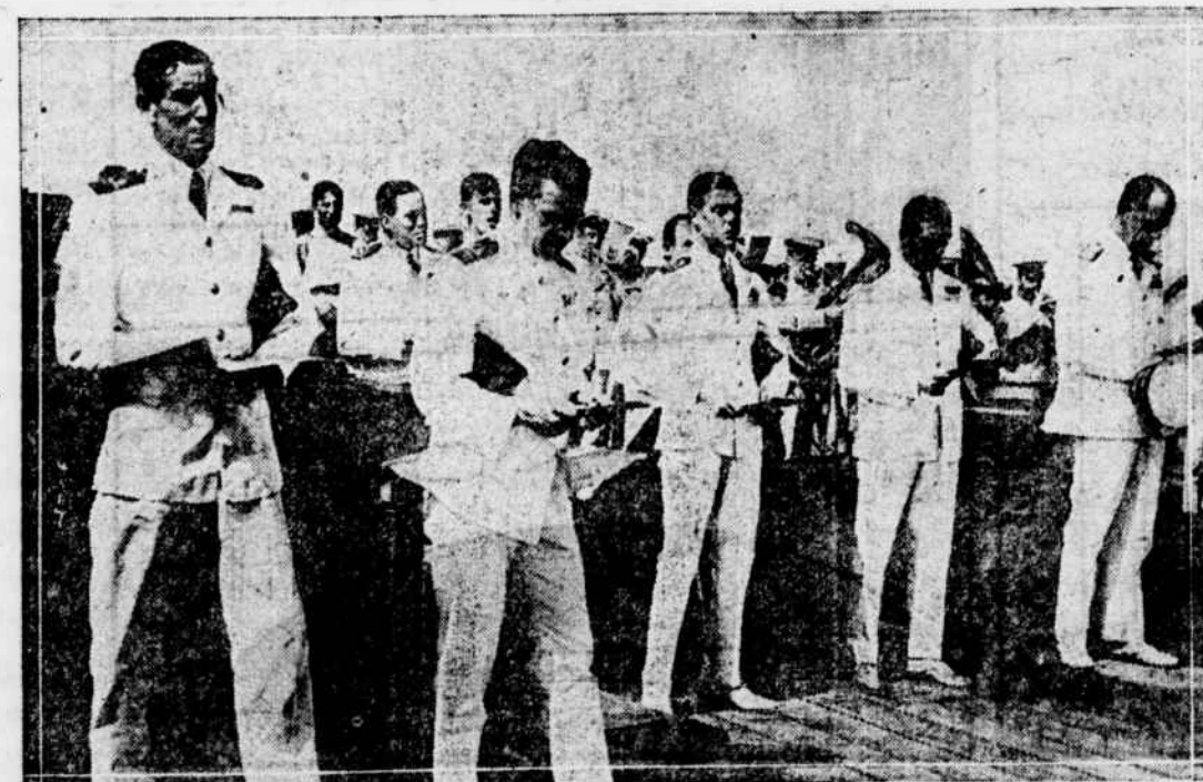
THE PRINCE OF WALES AND STAFF ATTEND DIVINE SERVICE ON H. M. S. RENOWN

Until permanent quarters can be obtained for them, evicted tenants in Newark, N. J., are now residing in tents. The government furnished 200 heavy, waterproof army tents for the purpose, each big enough for three or four persons, and the city of Newark appropriated $25,000 to house the unfortunates. Streets on the plan of Military streets have been laid out, electric lights supplied, and the tent dwellers are comfortable and happy, and thoroughly enjoying the novel experience. Their food is cooked in a large community kitchen at a small charge.