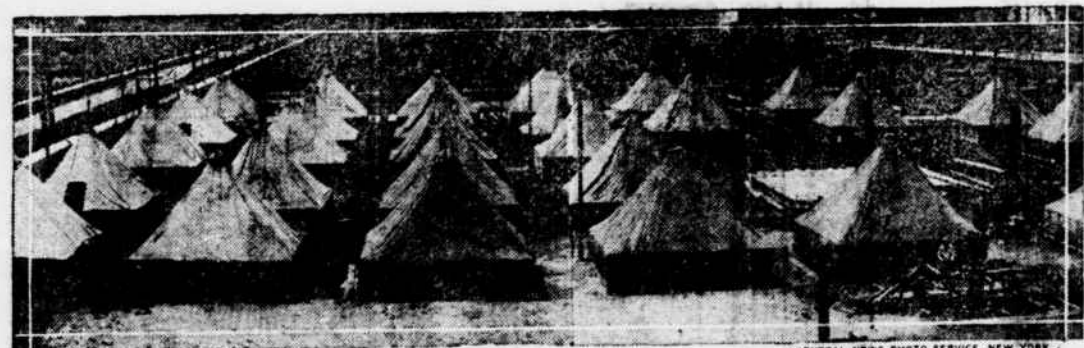
A CITY OF TENTS