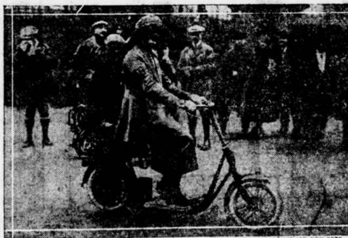
THEY "SCOOT" ABROAD

The Democratic National Convention will be held here in June. The central building is the beautiful City Hall.