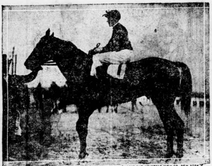
MAN O'WAR, WINNER OF FAMOUS PREAKNESS