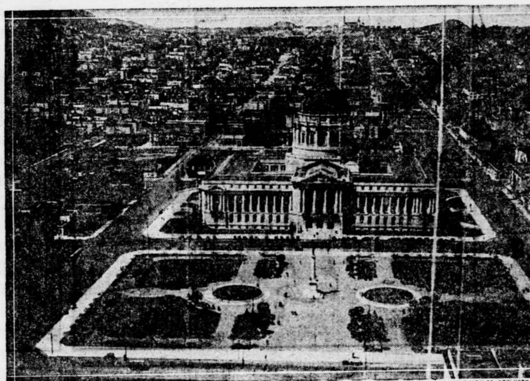
SAN FRANCISCO FROM THE AIR

The bodies of 138 American sailors and marines, which were interred in the Kerfentras military cemetery at Brest, France, reached New York May 18th, and the following day impressive funeral ceremonies were held at the Brooklyn Naval Base. Secretary Daniels paid a glowing tribute to the heroes who gave their lives for their country, and 200 sailors from the battleship Tennessee formed a guard of honor. The bodies will be sent to their homes in various parts of the country.