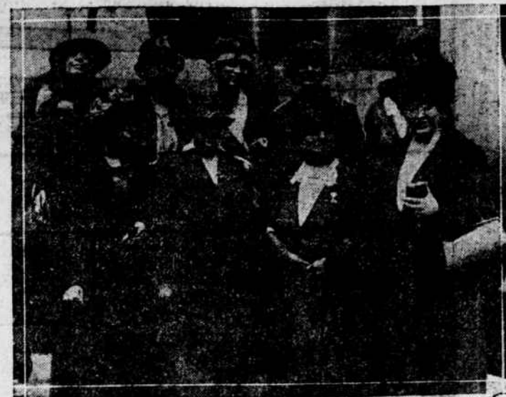
AMERICAN SUFFRAGE LEADERS SAIL ON THE "ROYAL GEORGE"

The 62-year-old wooden frigate Richmond is to be burned for her metals, on the beach at Eastport. Once the pride of the U. S. Navy, she served in three wars. There is about 200 tons of high grade copper which is said to have been used in her construction. The Richmond was built in 1858, is 125 feet long, 43 feet wide, 17 feet deep and was formerly a full rigged warship with sixteen boilers.