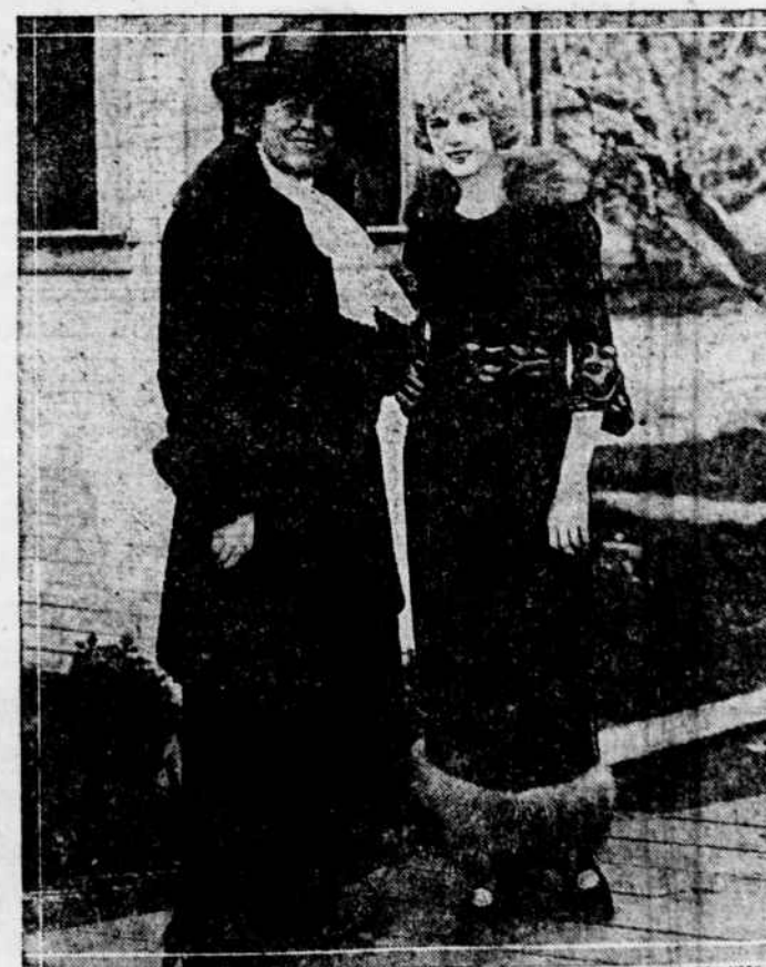
CAROLINE LOCKHART AND ANITA STEWART