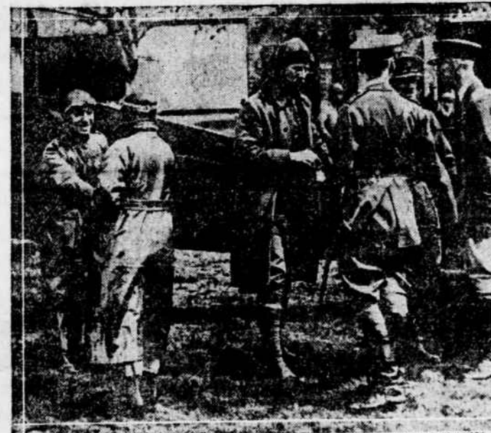
ROYAL FLYERS IN CROSS CHANNEL FLIGHT