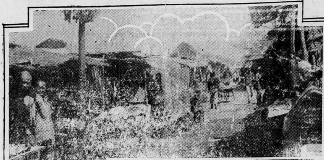
AS IT ONCE WAS.

NEW YORK—American globe trotters are beating a broader path into the Orient than ever before, according to reports reaching here from travel agencies in the Far East.