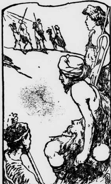
THE CAMELS OF THE WISE MEN SWEEPING BY.

Let fools with much pretense of wisdom scout The truth and wag their heads in owlish doubt Of Great Jehovah's all embracing scheme Because there is a door they stand without.