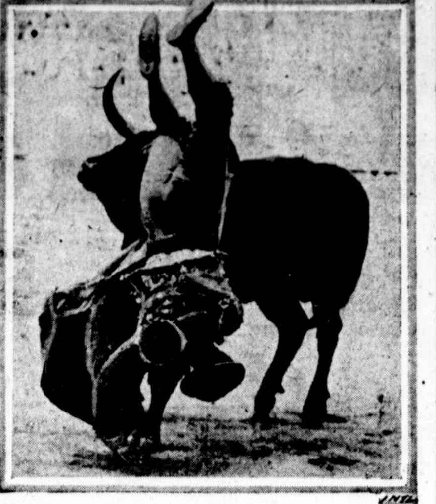
This toreador was badly injured in his fight with a bull in the Barcelona Bull Ring, Spain. While attempting to grab the animal by the horns, the toreador missed his grasp, and the bull, quickly taking advantage, tossed him in the air.