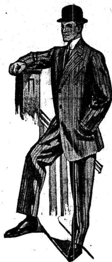
COPYRIGHT 1908 BY THE MESSRS OF MICHAELS, STERN & CO FINE CLOTHING MICHAELS, STERN & CO. BROOKLYN, N. Y.