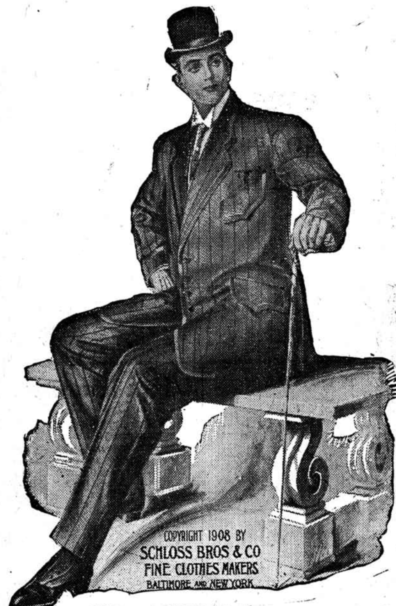
COPYRIGHT 1908 BY SCHLOSS BROS & CO FINE CLOTHES MAKERS BALTIMORE AND NEW YORK

will be offered for cash at Prices far below Actual Value to reduce our immense stock.