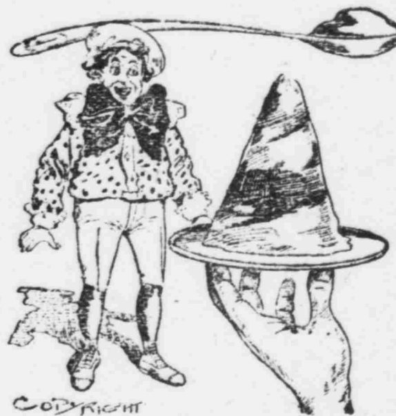
A PLEASING RECEPTION