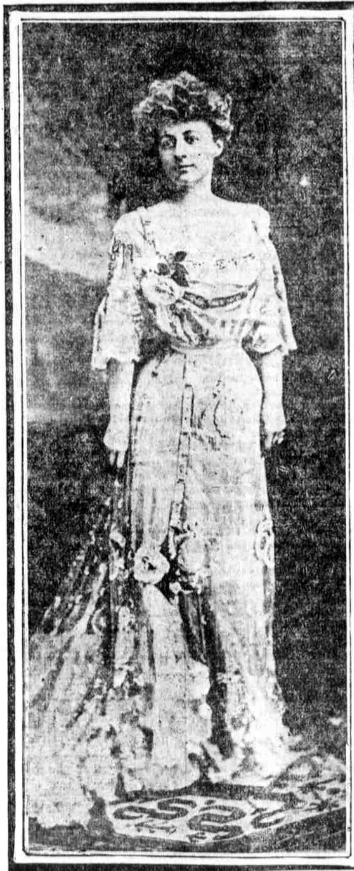
Mrs. Cornelius Vanderbilt, who, worn by long vigils at her husband's bedside, is now under a physician's care.