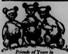
Friends of Yours in Yellowstone