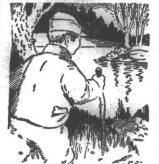
He No Longer Swam About Freely When Farmer Brown's Boy Was There as He Used To.

Just take the case of Jerry Muskrat and Farmer Brown's Boy. Through kind and thoughtful deeds for a long time Farmer Brown's