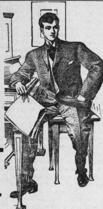
Copyright 1905 by Hart Schaffner & Marx

Our glove and mitten department is full, and contains some fine new things