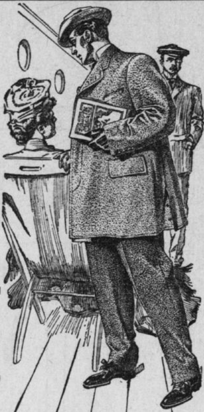
Copyright 1905 by Hart Schaffner & Marx

You must have underwear; why not come here? We buy all our underwear by the case.