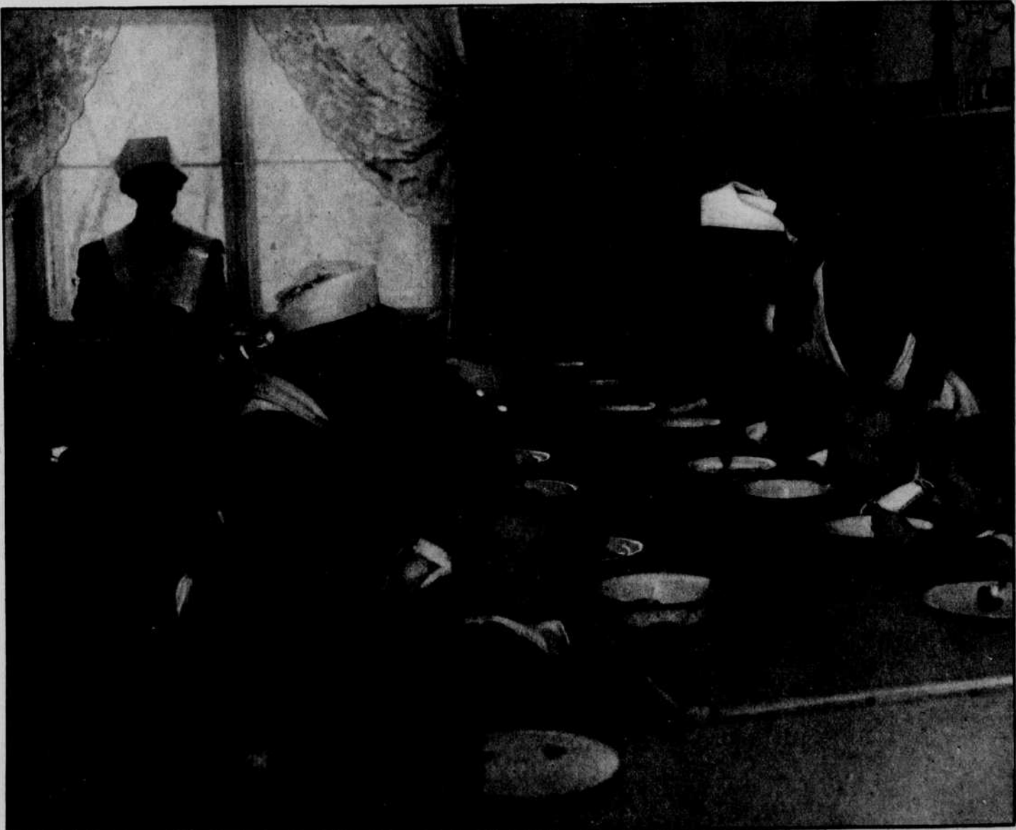
In Groups, at Appointed Places, with Nurses in Charge, Berlin's Soldier Children Are Fed.