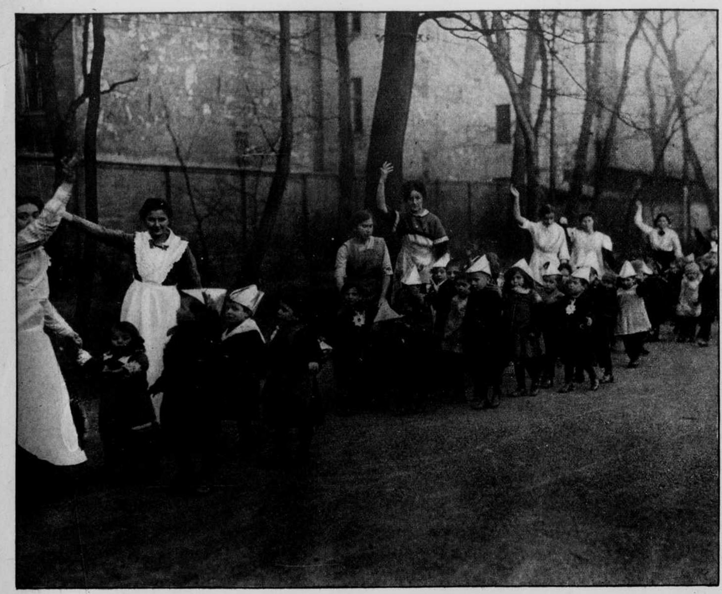
Life Is a Pageant and a Play to These Children in Berlin Whose Fathers Are at the Front.