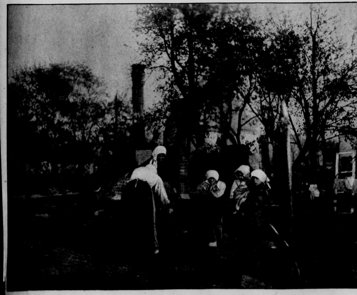
A Group of Peasants Returning to Their Homes After the War Has Desolated the Familiar Scenes.