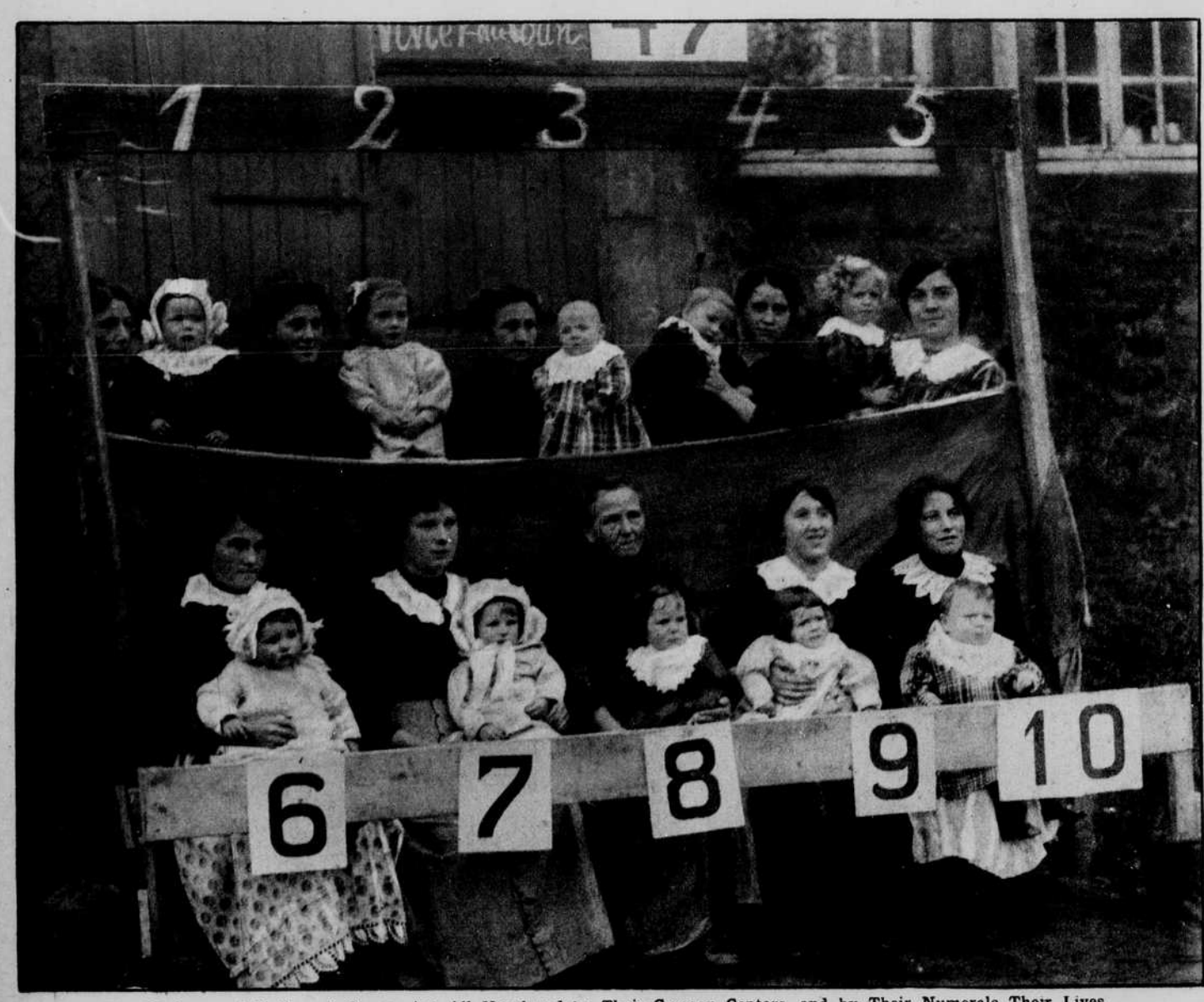
The Mothers and Babies of France Are All Numbered by Their German Captors, and by Their Numerals Their Lives Are Arranged.