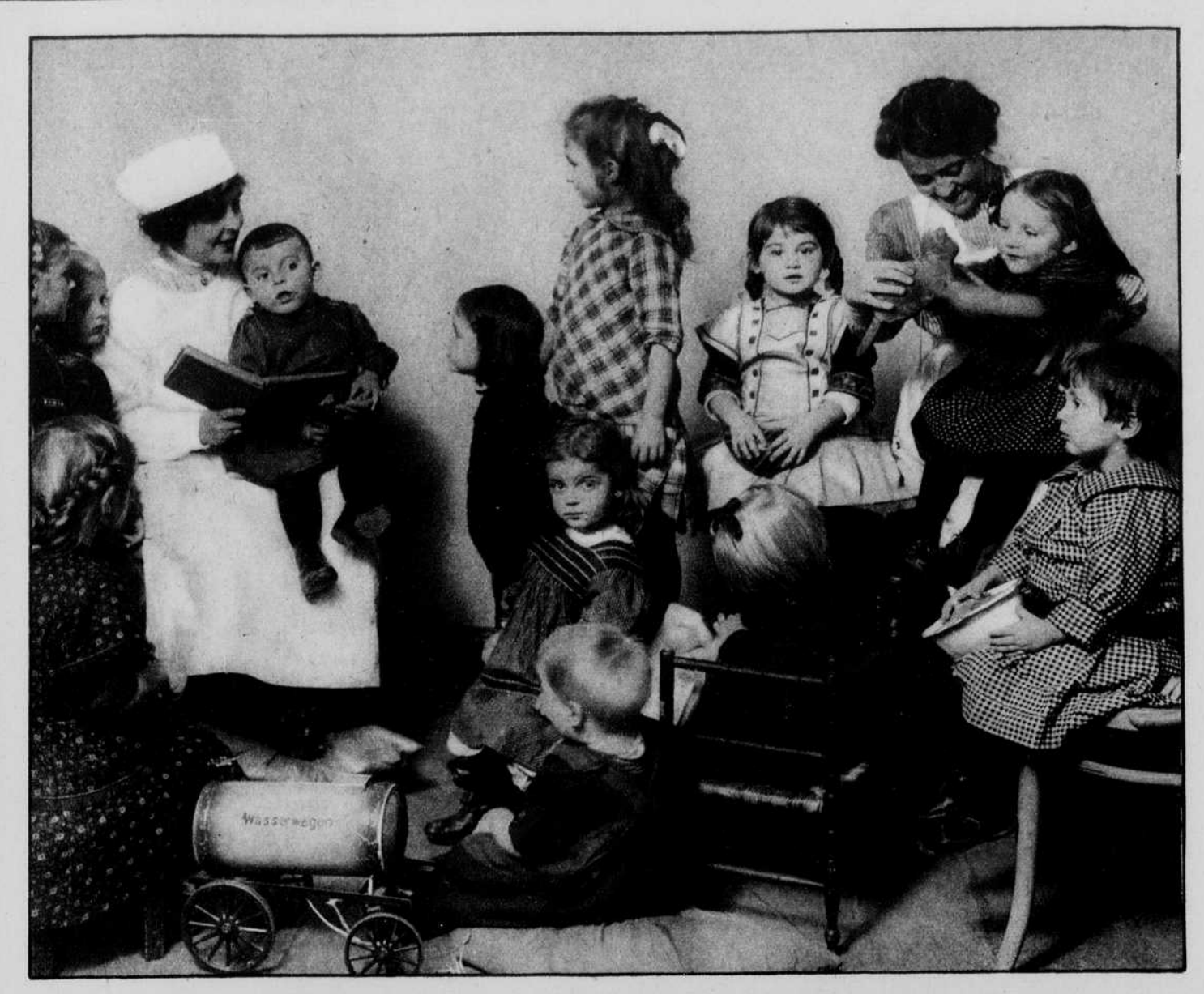
Toys Abound and the "Wasser-Wagen" Travels About the Playrooms Which the Government Provides for the War Orphans.