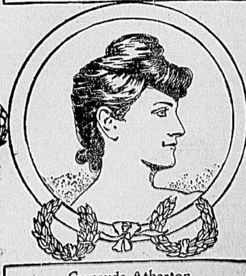
Gertrude Atherton, Author of "Senator North," "The Conqueror," &c.