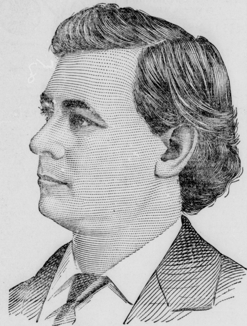
CONGRESSMAN HOWARD OF ALABAMA.

A Remarkable Case Reported from the State of New York.