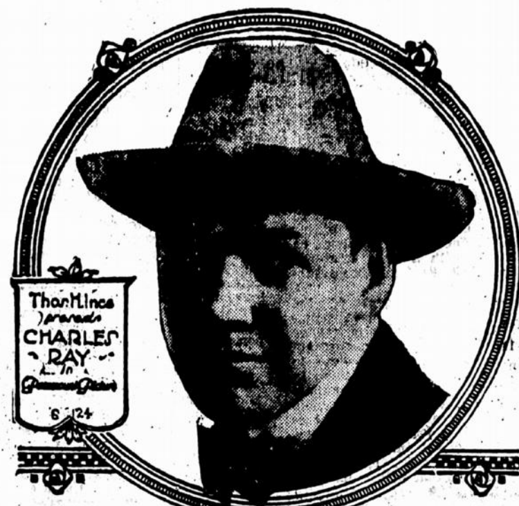
Charles Ray, whose wonderful characterization in "The Claws of the Hun" will be shown at the Bismarck Theatre tonight.

CHICAGO LIVESTOCK. Hogs, receipts 21,000; generally 25c higher; tops $20.30; butchers $19.20 to 20.40; packing $18.85 to 19.30; rough $17.75 to 18.50; pigs, good and choice $18.50 to 19.00. Cattle, receipts 28,000; steers good and better steady to strong; others and butcher stocks slow to 25c lower, calves slow to lower; beef cattle good, calves and prime, $16.85 to 19.10; common and medium $10.50 to 16.85; butcher stock, cows and heifers $16.75 to 17.45; calves $18.00 to 18.75. Sheep, receipts 40,000; slow; irregularly steady to 25c lower; good fat classes relatively scarce.