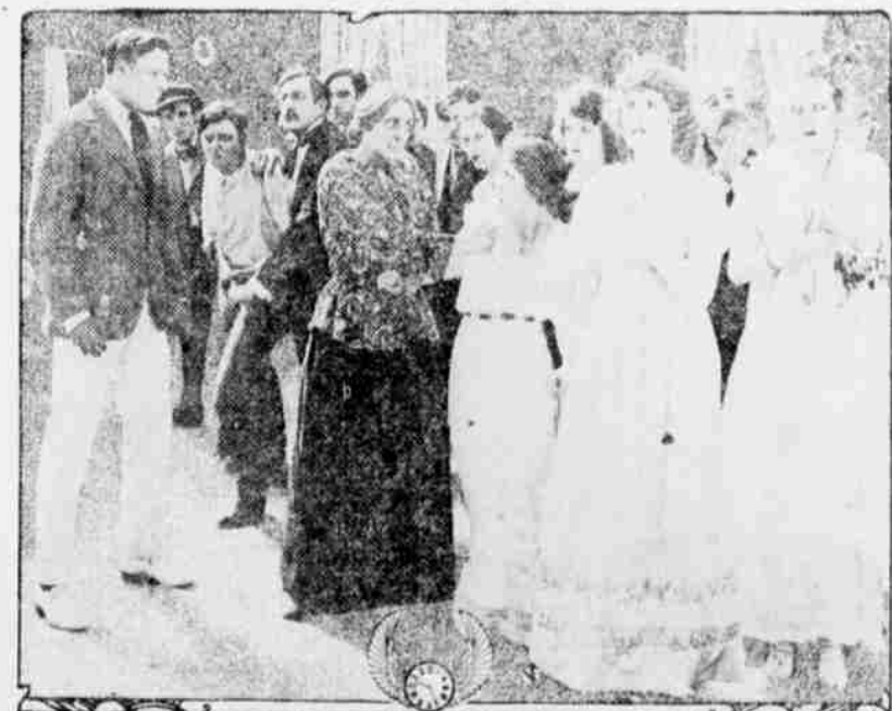
SCENE FROM "THE END OF THE ROAD" FIVE-ACT MUTUAL MASTERPIECE MADE BY AMERICAN

Want to borrow money? World Want Ads will put you in touch with the right party.