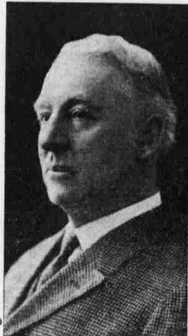
HON. ROBERT A. BOOTH,

Republican Candidate for United States Senator.