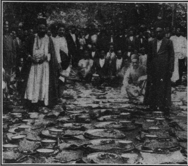
Socialist Dinner in the Grounds of the English Consulate at Tabriz. The Platters Contain Soup, Bread and Meat. The Consulate is a Place of Refuge for Those Who Fear They Are Offending Against Political "Bosses."