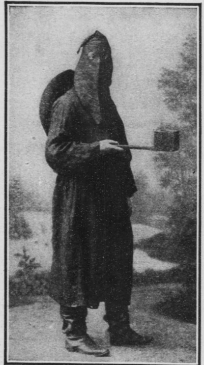
FOR EARTHQUAKE SUFFERERS A Brother of One of the Italian Charitable Societies Engaged in Collecting Alms for the Survivors of the Earthquake.