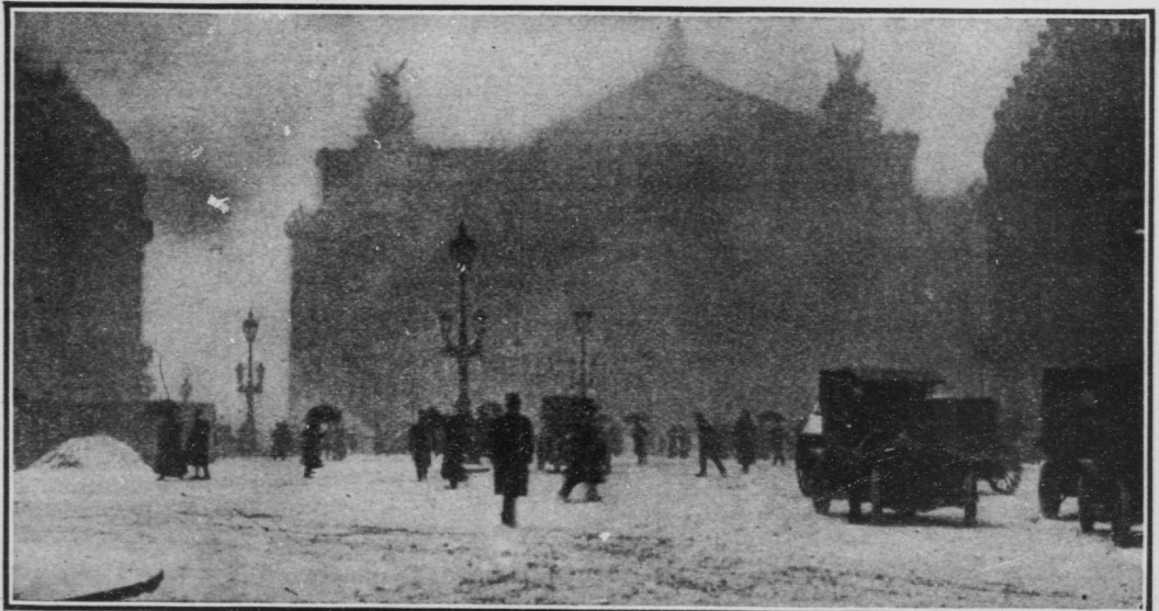
The Place de L'Opera in What Paris Would Term a Fearful Blizzard, but What Would Be Called "Just a Flurry" in Montana. This Recent Storm Was One of the Worst Ever Seen in the French Capital.