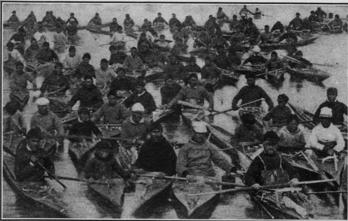
A SEALING PARTY IN FAR-AWAY GREENLAND Eskimos in Their Frail Kayaks About to Start On a Hunt for Seals. Sealing is a Government Monopoly, and the Men Are Therefore Virtually Government Employees.