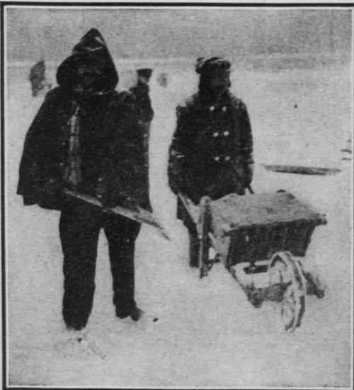
City Employees with Sand for the Slippery Places.