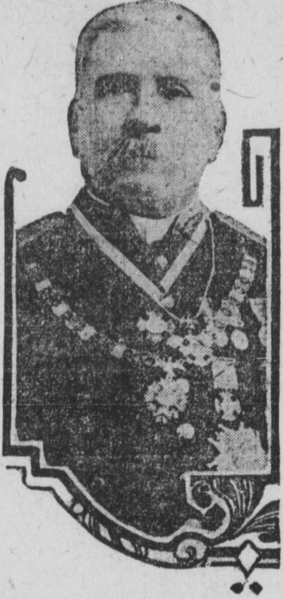
GEN. PORFIRIO DIAZ