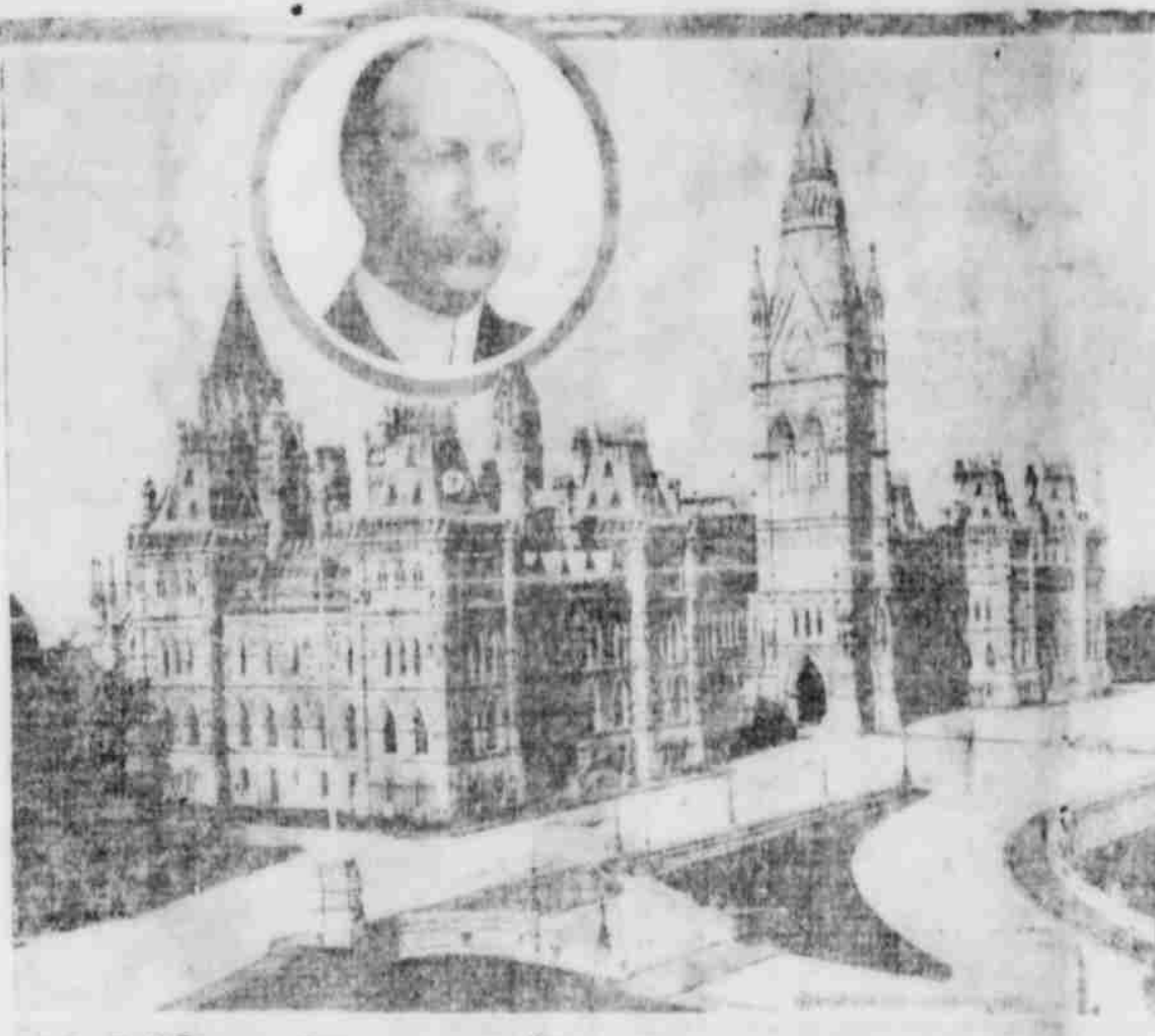
Martin Burrell, Minister of Agriculture