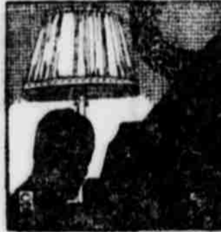
TABLE LAMPS Artistic in shape and especially featured at these prices— $6.00 to $15.00

44 Shopping Days Till Christmas BEAUTIFUL LAMPS TO TAKE THE PLACE OF OLD ONES