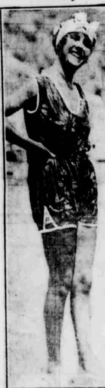
This bathing beauty at Lignano, Italy, wears as scanty a costume as some of our fair water nymphs. Flowered silk gives a novel effect.