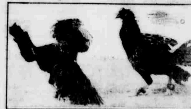
Although cock fighting is prohibited by state law, game birds are sometimes pitted against each other in a small town in southern Texas. This picture shows two game cocks ready for the fray, just before their galls were unsheathed.