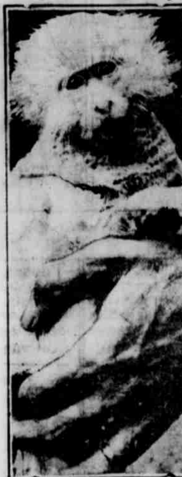
One of the most unusual specimens ever received at the London Zoo. He's an albino monkey from Tanganyika.