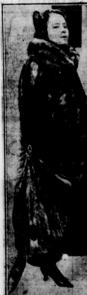
Good summer picture, this. Next winter's fur style. Cape of median pattern. It is of fish, trimmed with Hudson seal.