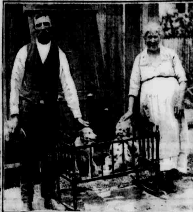
A farmer, wife, child and dog in front of their new home, an old stable at Hibbs, Pa. They were among the strikers' families evicted from homes owned by operators at Hibbs, Pa.