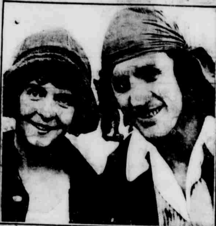
Ze Gorgeous Carp, once humbled by ze Dampsey, he now max' his own knock-out, as Americaine say, in ze jumping flickers. He win ze petite Mademoiselle Fiera Le Breton in ze film and zen save her on ze beach. Ze grand hero, n'est-ce pas?