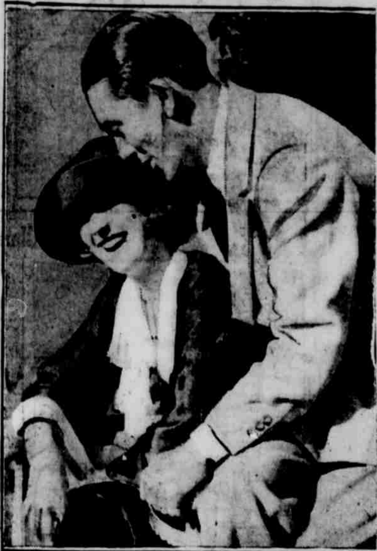
Jack Pickford and Marilyn Miller hold a little tete-a-tete after her arrival in Hollywood to become his bride. Sure, one chair was enough.