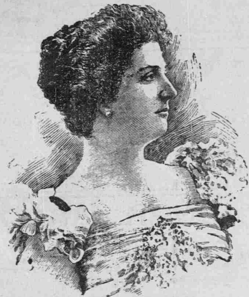
CROWN PRINCESS OF SAXONY.

HELENA, Feb. 10.—The Legislature has defeated the woman suffrage bill.