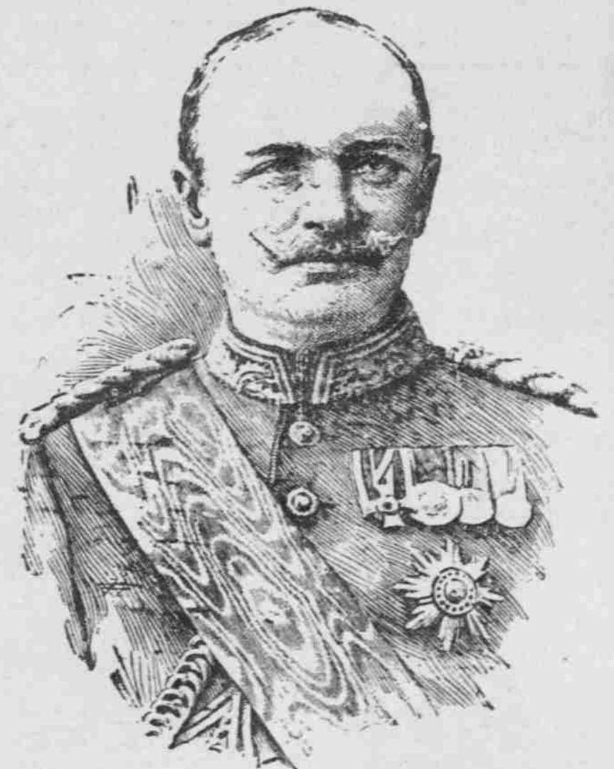
CROWN PRINCE OF SAXONY.

CHICAGO, Feb. 10.—The elevator strike has been settled.