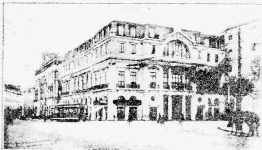
HOTEL AVENIDA PALACE

The rebels have taken possession of the city and the royal palace. The king has fled to the north and the rebels have declared the republic. The revolution is now in its third day and the rebels are still in possession of the city. The king has fled to the north and the rebels have declared the republic. The revolution is now in its third day and the rebels are still in possession of the city.