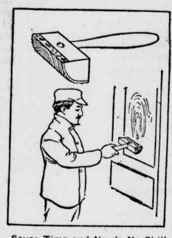
Saves Time and Needs No Skill.

Hereafter it will not be necessary for a painter to learn graining and such work will probably not command such high prices as it does now. An Ohio man has produced a handy little tool that is destined to revolutionize this work, for it means an incalculable saving in time, and the graining is