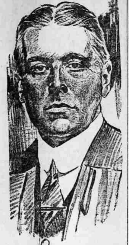
Judge Samuel Seabury.

The Democrats of New York, after much testing of different men, have chosen Judge Seabury of the court of appeals to be their representative in the race for governor of the state of New York. Judge Seabury will have as his opponent Governor Whitman, and it may be possible that Judge Hughes will have some very pertinent things to say about the race, as Governor Whitman is his personal and political friend. Fifty-six out of sixty-nine counties of the state went on record as favoring the nomination of Judge Seabury.