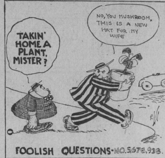
FOOLISH QUESTIONS—NO. 5678, 938.