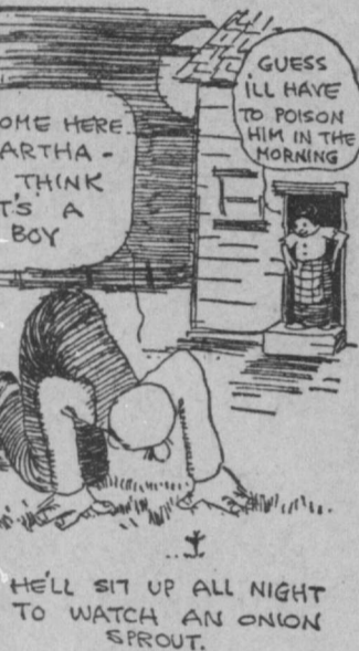
HELL SIT UP ALL NIGHT TO WATCH AN ONION SPROUT.