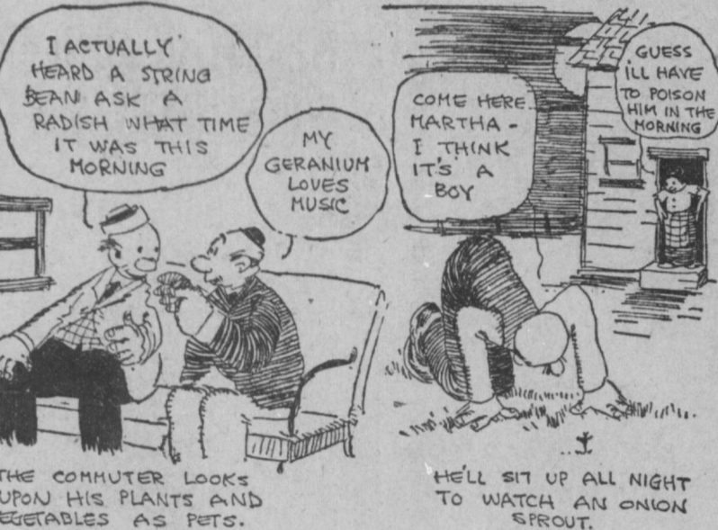
THE COMPUTER LOOKS UPON HIS PLANTS AND VEGETABLES AS PETS.