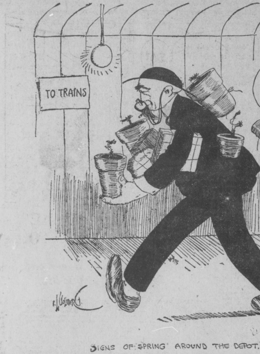
SIGNS OF SPRING AROUND THE DEPOT.

ITS TIME TO PLANT THE PRUNE TREES AND APPLE-FRITTER VINES.—By Goldberg.