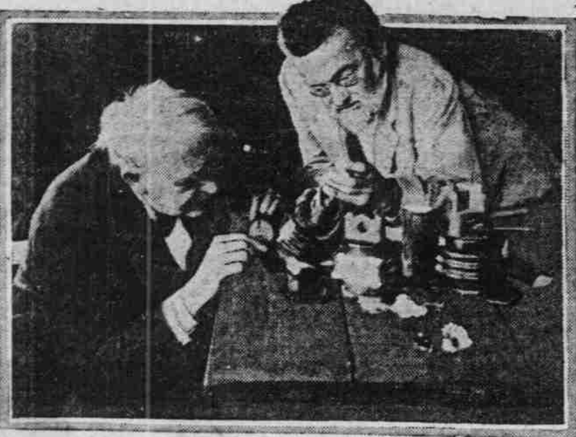
Dr. Charles P. Steinmetz entertained Thomas A. Edison in his Schenectady laboratory and showed the latter some evidence of the work done by an "artificial lightning machine" developed by Dr. Steinmetz.