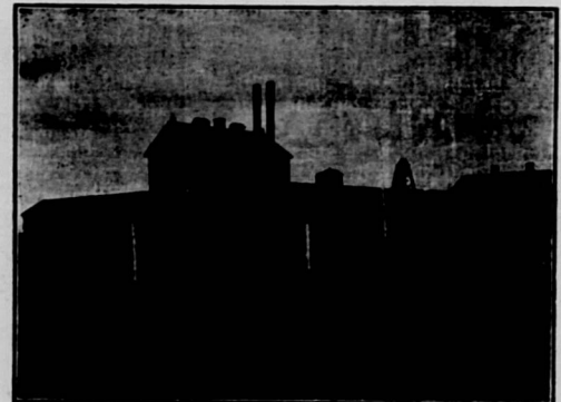
The Hartman Alfalfa Meal Mill