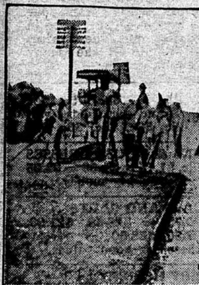
Building Asphalt Pavement.