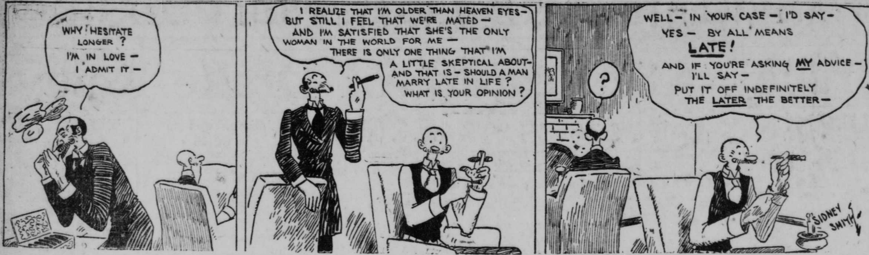
FRECKLES AND HIS FRIENDS—Identified!